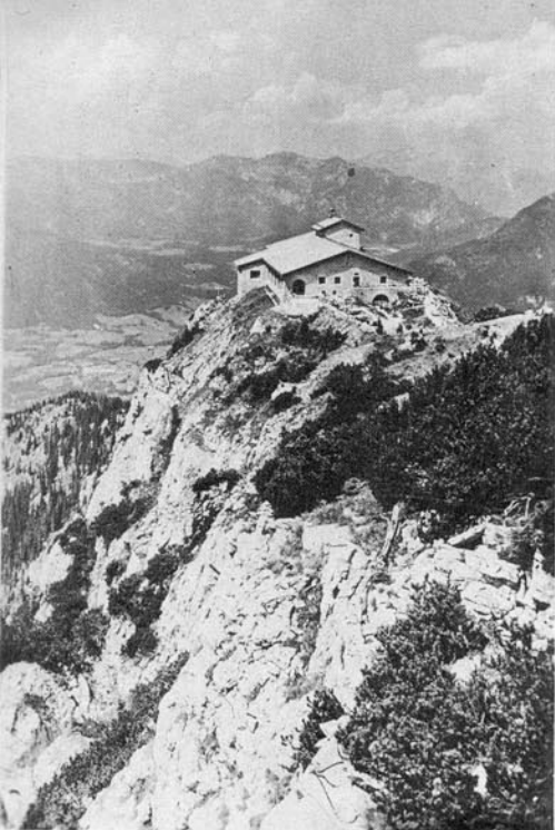
Hitler's Eagles Nest – before the war.