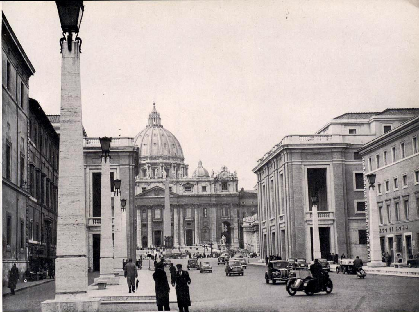
They viewed the majesty of St. Peter's