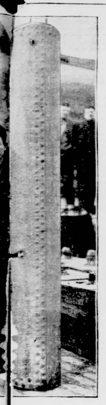
SED AIR IN SUBMARINES. furnishes motive power.