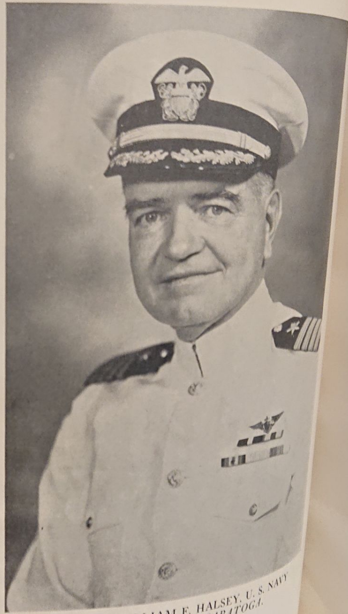
CAPTAIN WILLIAM F. HALSEY, U. S. NAVY Commanding U. S. S. SARATOGA.

THIS ship by Congre Work on her tion of Arma into an aircrat