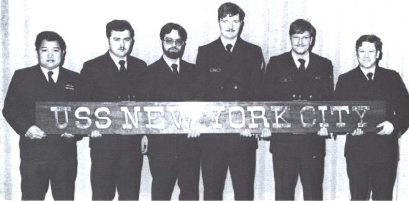
Food Service Division