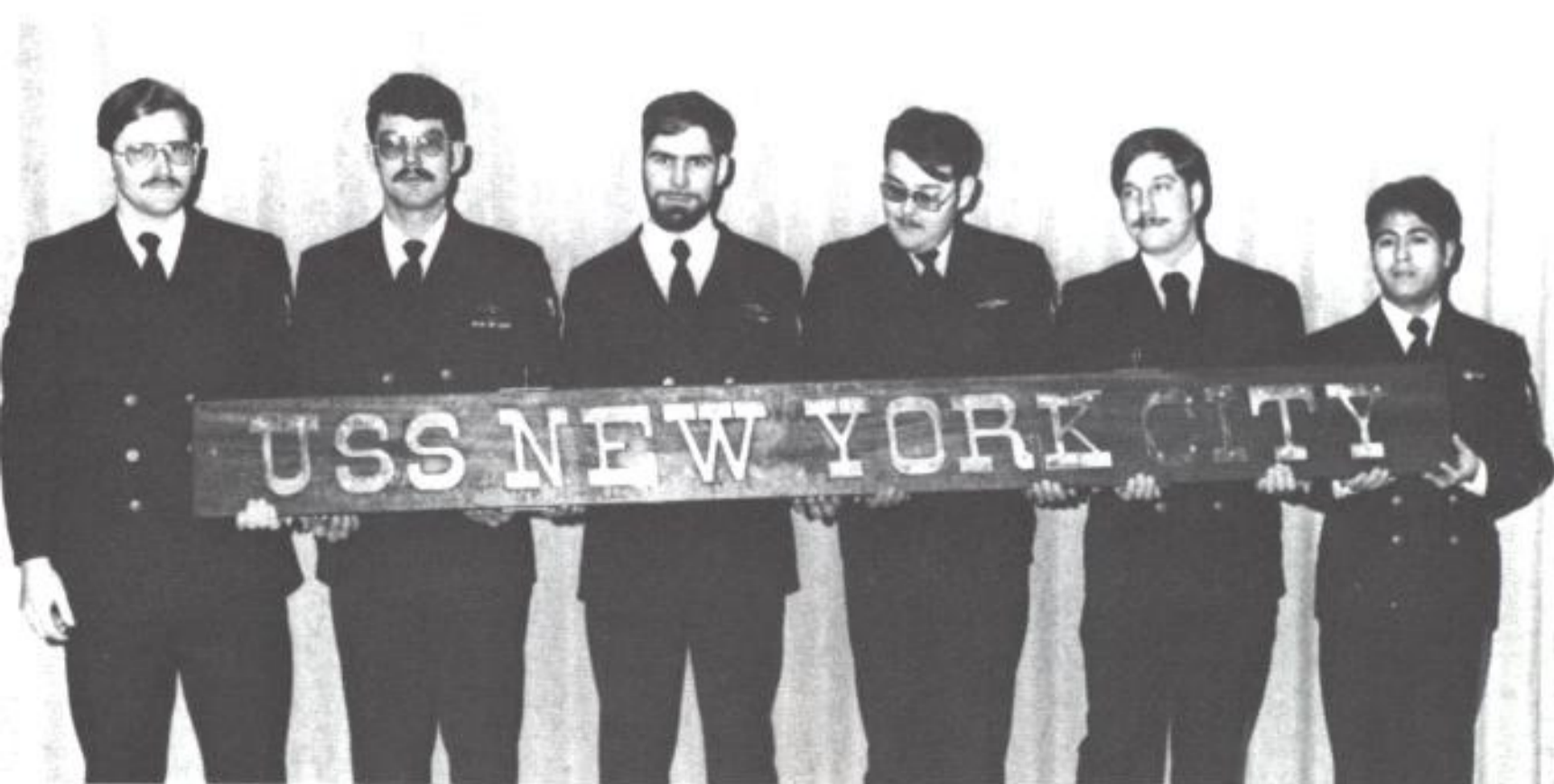
Electronic Material Division