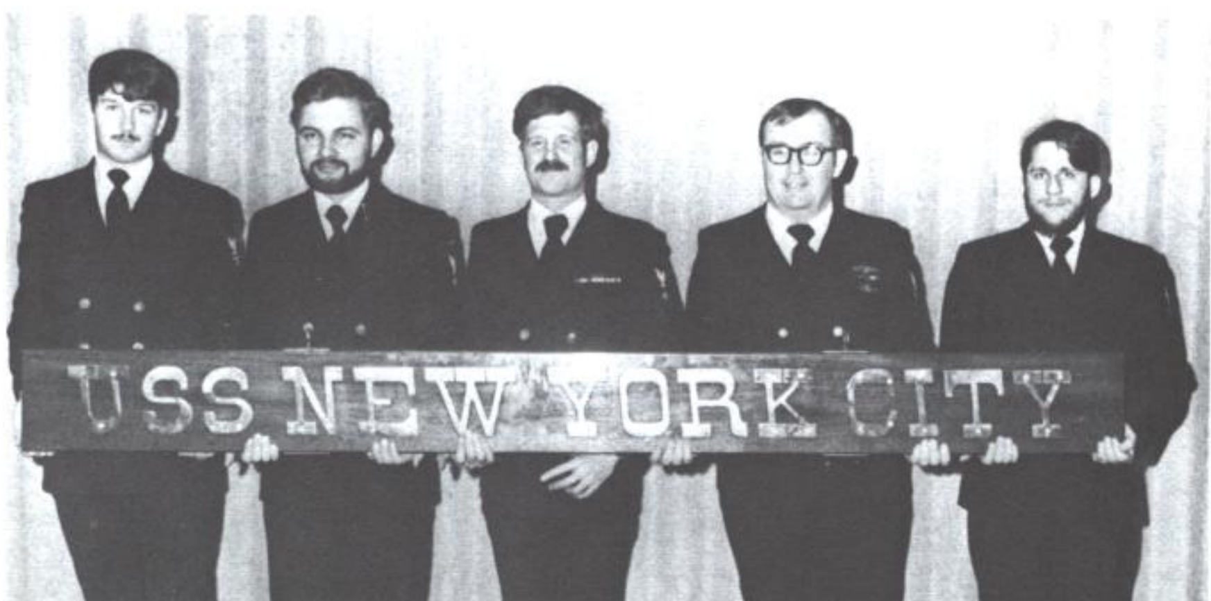
Fire Control/Data Systems Divisions