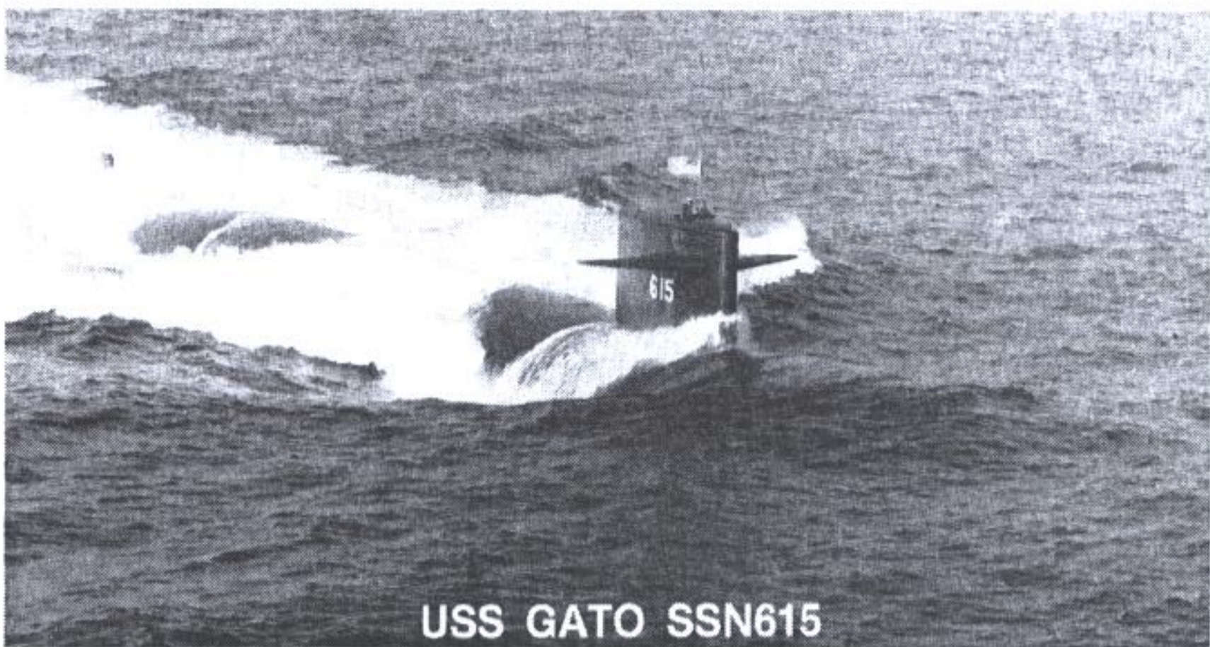
USS GATO SSN615

Originally intended as the twelfth submarine of the PERMIT Class, GATO was extensively modified during the construction period. Shortly after launching, she was towed to the Quincy Division of General Dynamics Corporation where various alterations were accomplished to increase her capabilities over previous ships of the class.