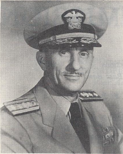
Rear Admiral Carl F. Espe, USN Commandant First Naval District