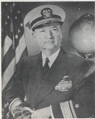
Rear Admiral F. B. Warder, USN Commander Submarine Force, U. S. Atlantic Fleet