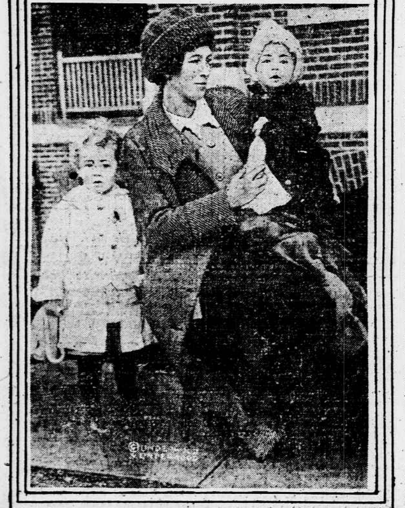
SURVIVORS OF S. S. STEPHANO, TORPEDOED AND SUNK BY GERMAN SUBMARINE.