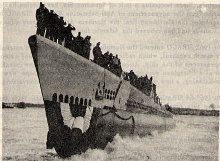
SIRAGO is launched in August, 1945