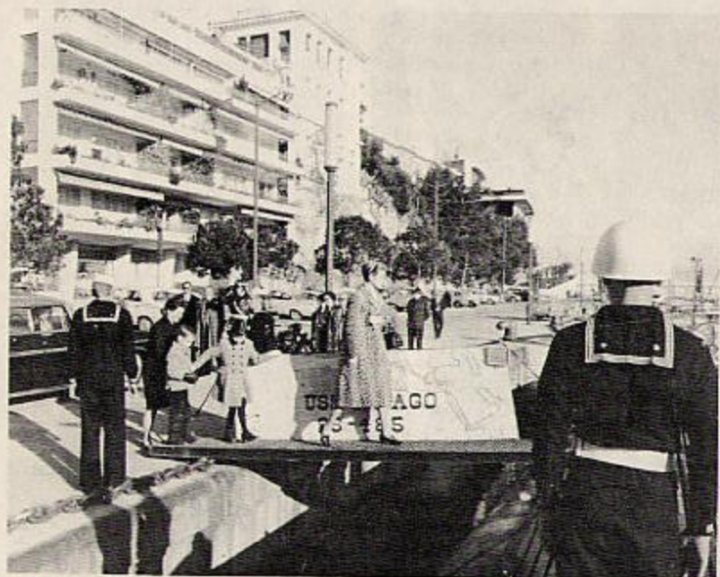
Princess Grace visits SIRAGO in Monaco

In early 1967 SIRAGO participated in Operation SPRINGBOARD and Exercise Clovehitch III, both in the Caribbean Sea.