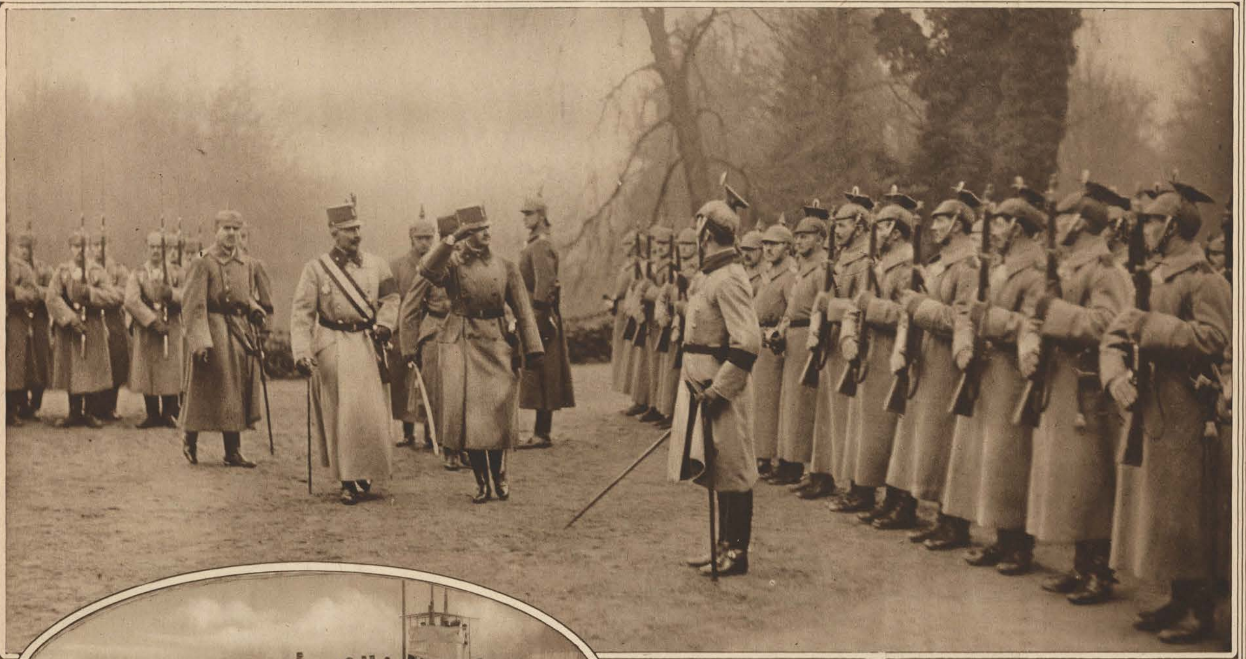
THE GERMAN EMPEROR AND CHARLES I, THE NEW EMPEROR OF AUSTRIA, REVIEW TOGETHER TROOPS AT THE GERMAN GRAND HEADQUARTERS IN FRANCE ON THE FIRST VISIT TO THE KAISER BY EMPEROR CHARLES SINCE HIS CORONATION.