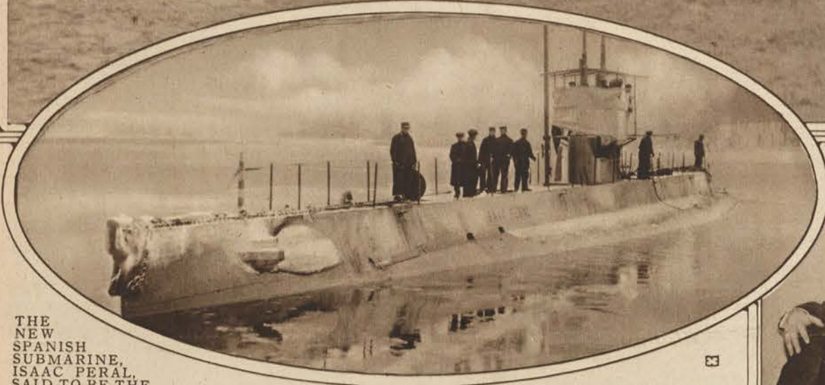
THE NEW SPANISH SUBMARINE, ISAAC PERAL, SAID TO BE THE LARGEST BUILT IN AMERICAN WATERS, LEAVING THE FORE RIVER SHIP YARDS FOR SPAIN IN CHARGE OF A SPANISH CREW.