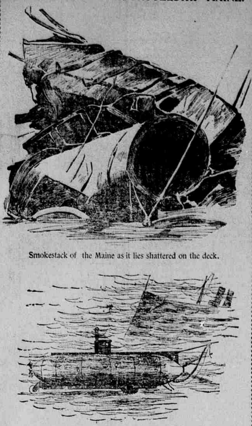
Smokestack of the Maine as it lies shattered on the deck.