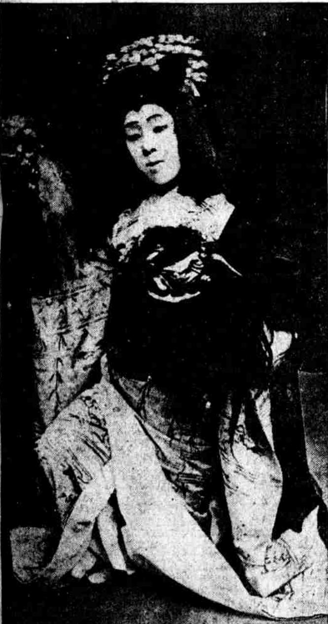
ONE OF JAPAN'S FAMOUS ACTORS, Baiko Onoe, of the Imperial Theatre; female roles are his especial forte. Here he is posed in the famous "Lion Dance."