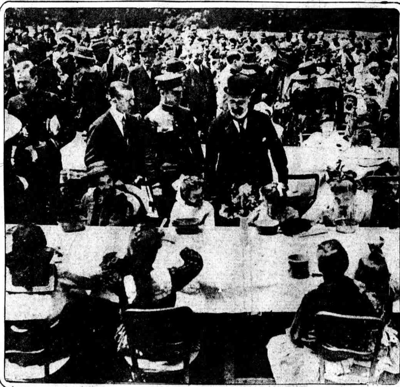
THE AMERICAN FOOD COMMISSION in Vienna has undertaken the work of supplying daily meals to many thousands of children who are in dire need. In the view, President Seitz, of the new republic of Austria, is making a tour of inspection accompanied by members of the American mission.