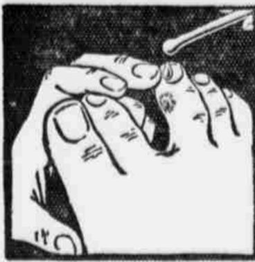
"Two Drops of 'Gels-It'—That's All!"

The Great Corn Loosener of the Age. Never Fails. Painless.