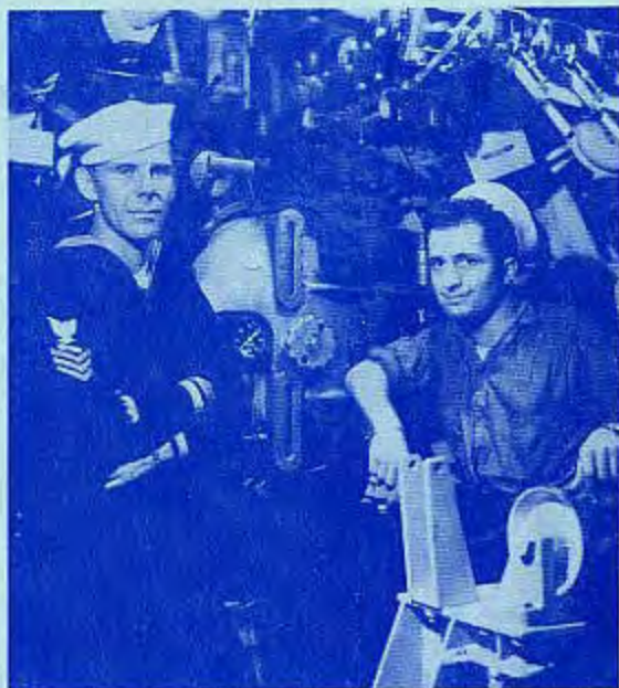
Crew members in after torpedo room during World War II.