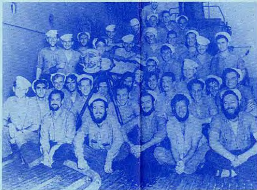
Pampanito crew during a "re-fit" period between war patrols.