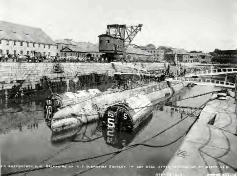
N.Y. PORTSMOUTH N.H. SALVAGING OF U.S. SUBMARINE SQUALUS. IN DRY DOCK AFTER REPAIRS BY AT BERTH AS 6