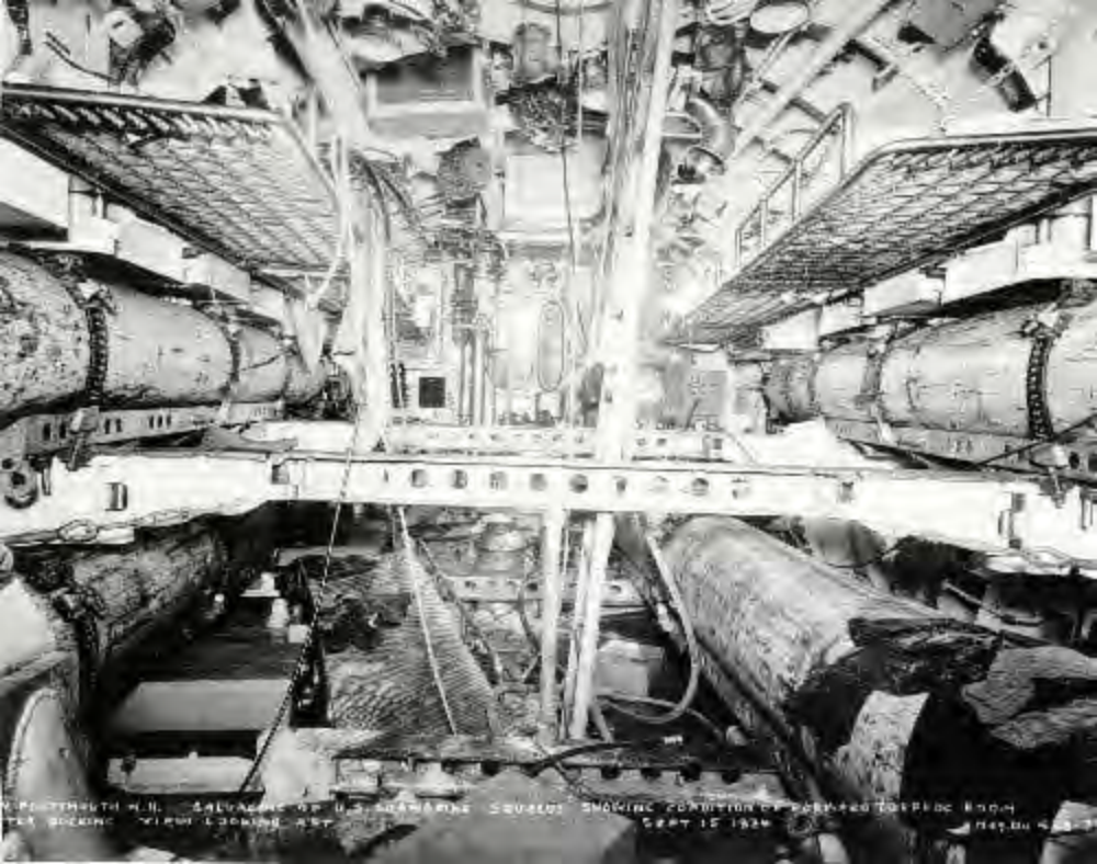
PORTSMOUTH H.N. SALVAGING OF U.S. SUBMARINE SQUADS SHOWING REMOVAL OF DAMAGED TORPEDOES THE DOCKING VIEW LOOKING EAST SEP 15 1938