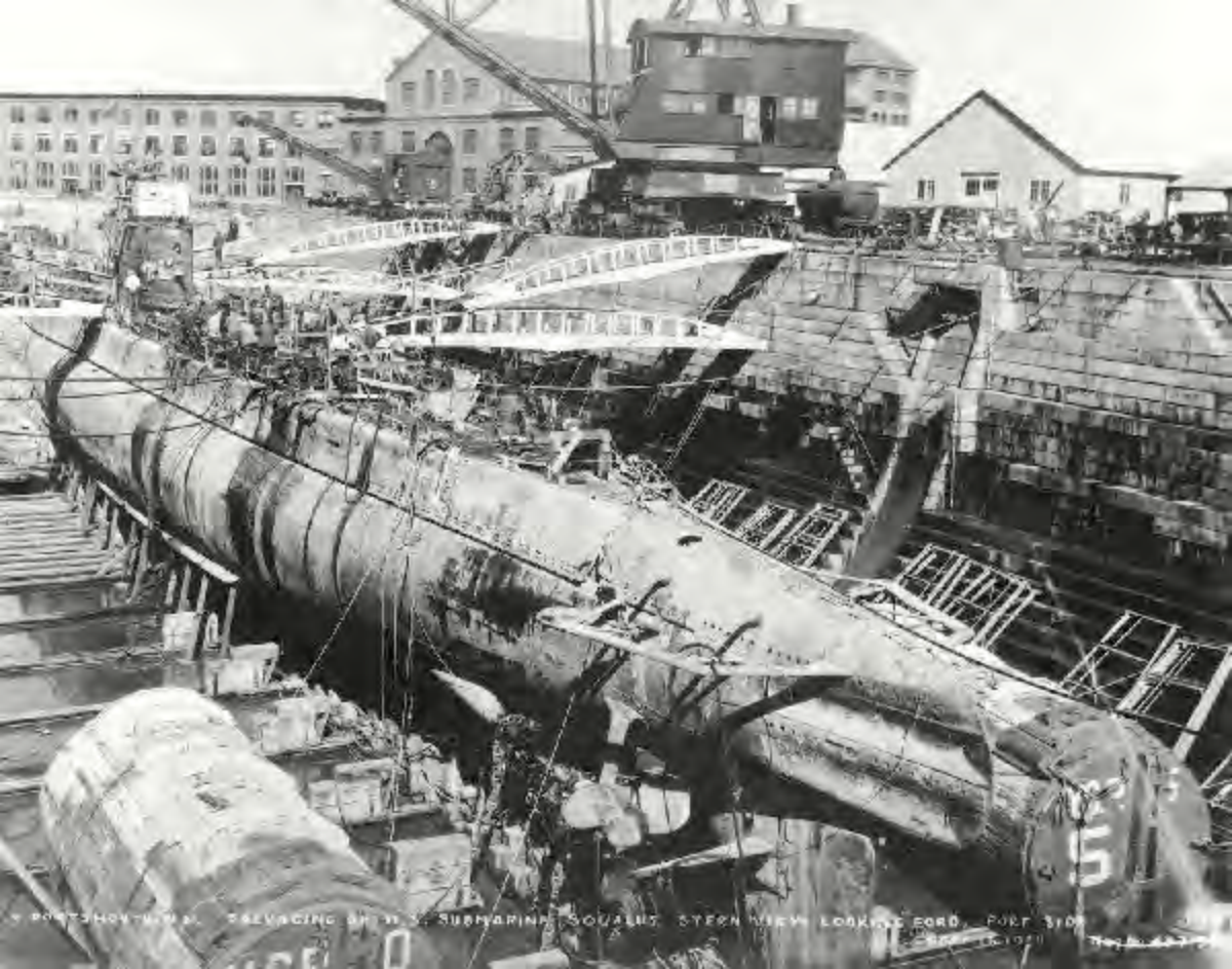
PORTSMOUTH, N.H. - BEHAVING BY U.S. SUBMARINE, SOLVING STEER VIEW LOOKING FORWARD, PORT 310