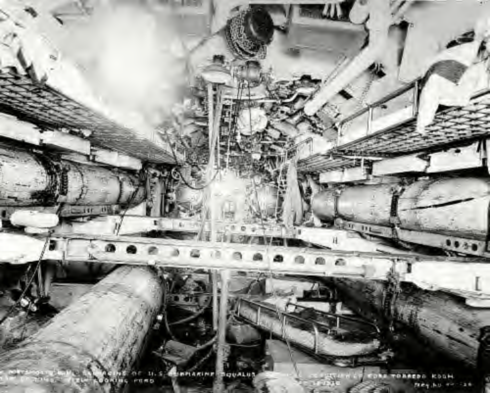
INTERIOR OF U.S. SUBMARINE SQUALUS LOOKING FORWARD