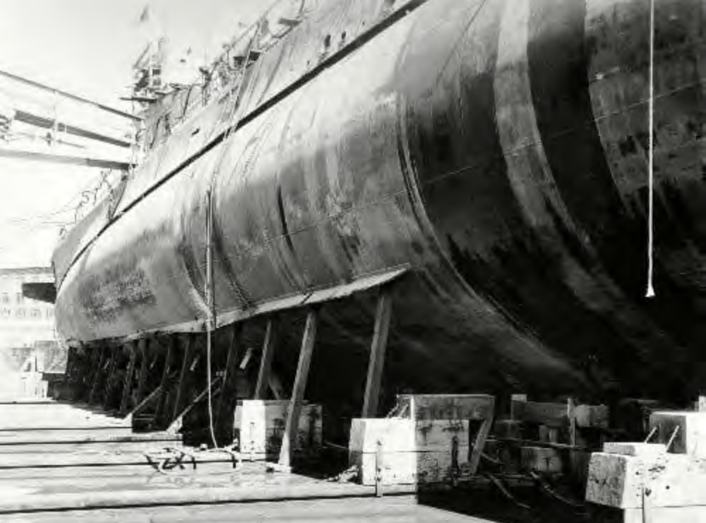
UNDERWAY, DRY DOCKING OF U.S. COGNACINE CORVETTE. VIEW SHOWING BULKHEADS JULY 15, 1924