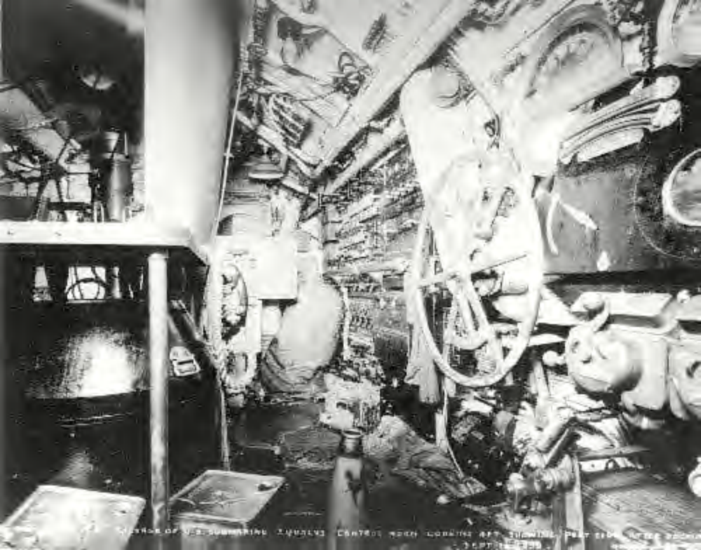
CONTROL ROOM LOCATED AT FORWARD PART OF U.S. SUBMARINE.