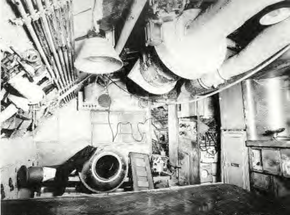
N. PORTSMOUTH, N.H. SALVAGING ON U.S. SUBMARINE SQUID. VIEW OF SALTY LADENKE YARD FROM AFTER PORT COGNAC