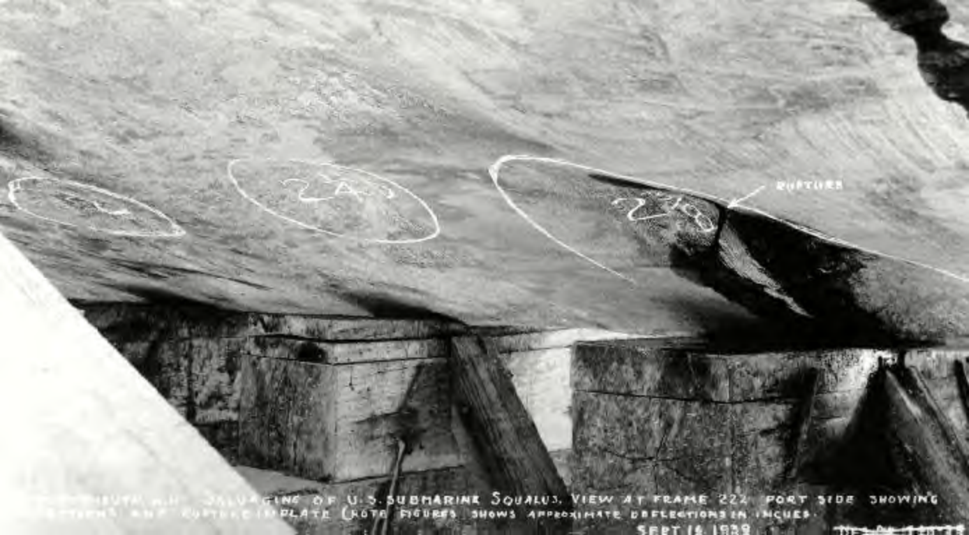
PERDUEBOTH A.H. SALVAGING OF U.S. SUBMARINE SQUALUS. VIEW AT FRAME 222. PORT SIDE SHOWING BUCKLING AND RUPTURED PLATE (NOTE FIGURES SHOWS APPROXIMATE DEFLECTIONS IN INCHES)