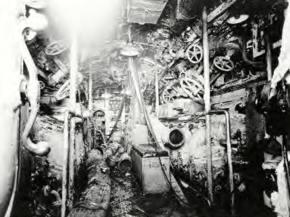
NORTHAMOUTH, N.H. SALVAGING OF U.S. SUBMARINE BOATLMS AFTER BATTERY ROOM LOOKING REE SEPT 15 1919