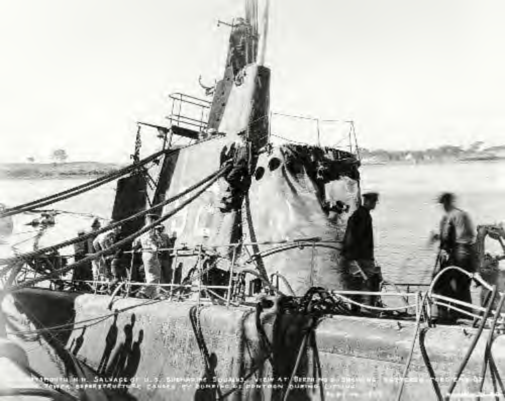
WINDHOLM, N. H. SALVAGE OF U. S. SHIPWRECKED SUBMARINE, VIEW AT BEACHING SITE SHOWING EXTENSIVE DAMAGE TO SUPERSTRUCTURE CAUSED BY SINKING AT BOTTOM DURING EXERCISE