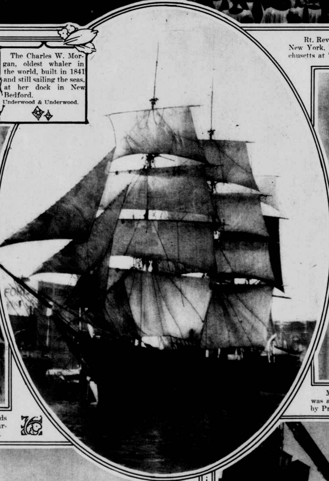
The Charles W. Morgan, oldest whaler in the world, built in 1841 and still sailing the seas, at her dock in New Bedford.