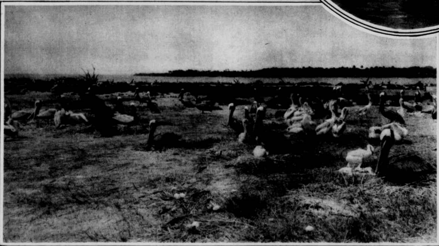
An unusual photograph of the colony of brown pelicans on Pelican Island, off the east coast of Florida, established as a bird refuge by the Government. Eggs and young birds are very carefully protected by the older ones, which gather food in the inland waters.