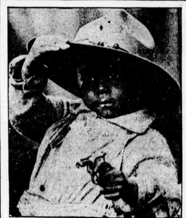
THIS PATRIOTIC LITTLE COLORED CHAP is saluting some of his colored brothers returned from abroad and now on the way to the demobilization camp.