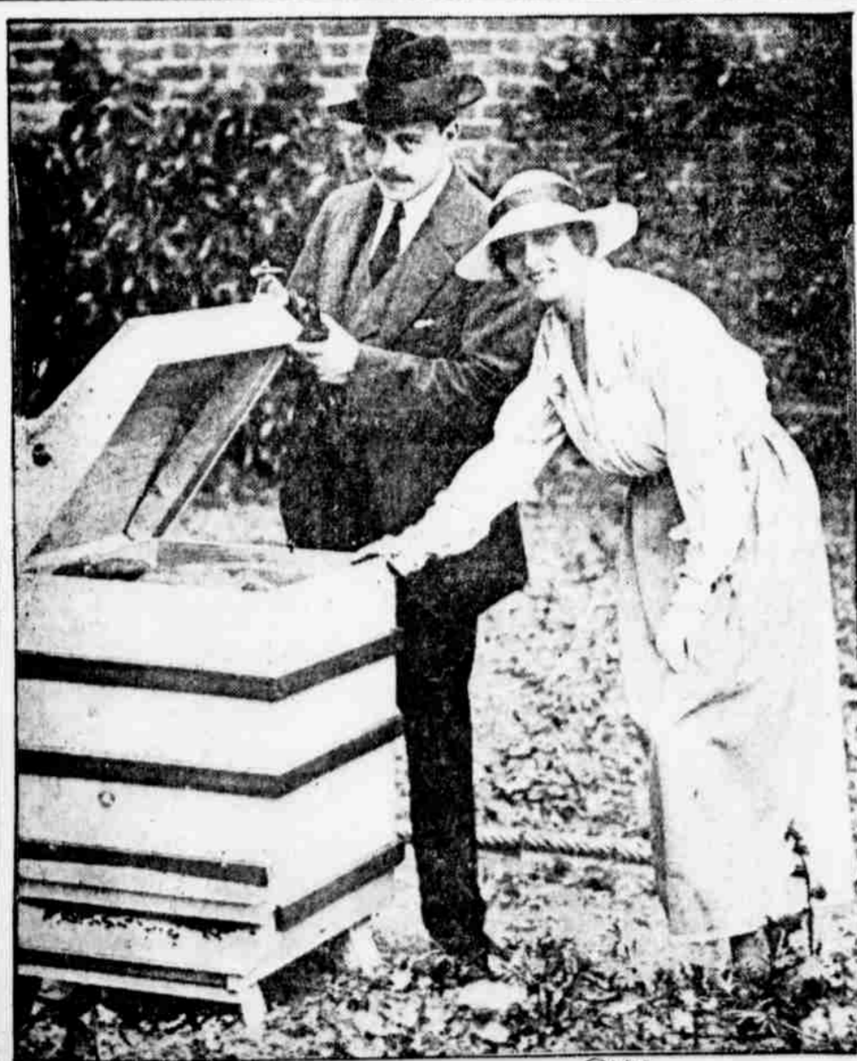
EX-KING MANUEL, so London reports, is ready to go back to Portugal if his country wishes him to return. In the meantime, Manuel and his wife, a distant cousin of the former Kaiser, are devoting most of their time in England to farming.