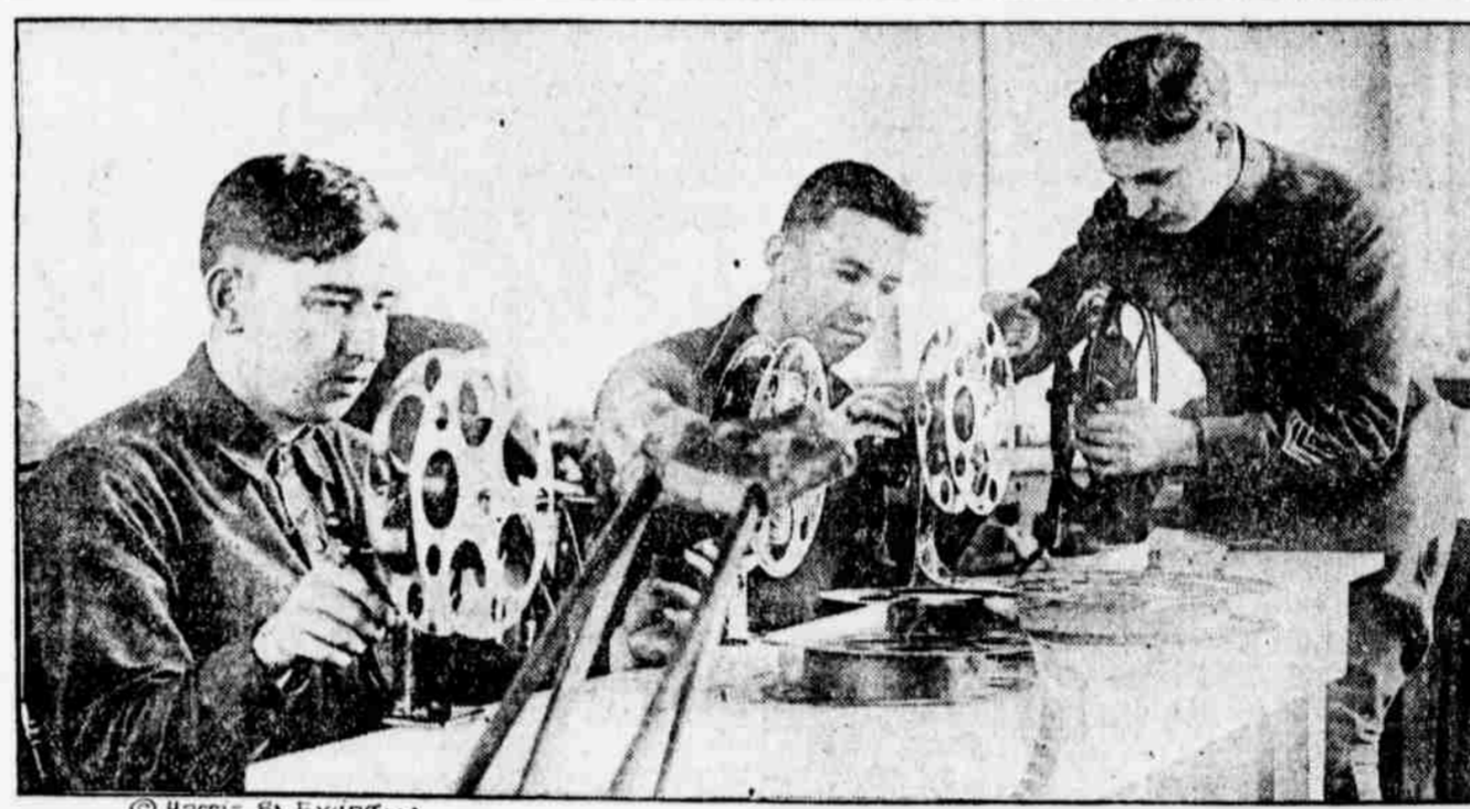
MANY WOUNDED SOLDIERS will operate motion picture projectors as soon as they are freed from the hospitals. Training in the operation of these machines is a part of the curative activities for patients in the Walter Reed Hospital, Washington