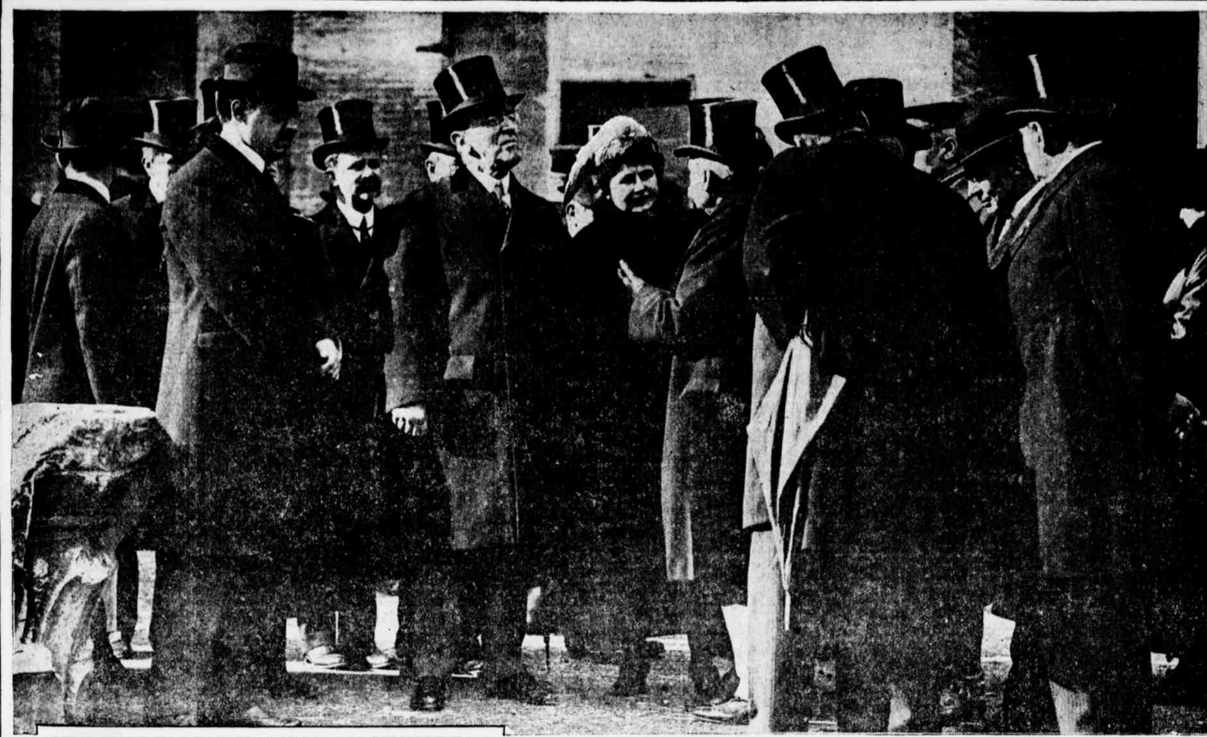
PRESIDENT AND MRS. WILSON'S ITALIAN HOSTS SHOWING THEM THE SIGHTS OF THE ROMAN COLOSSEUM