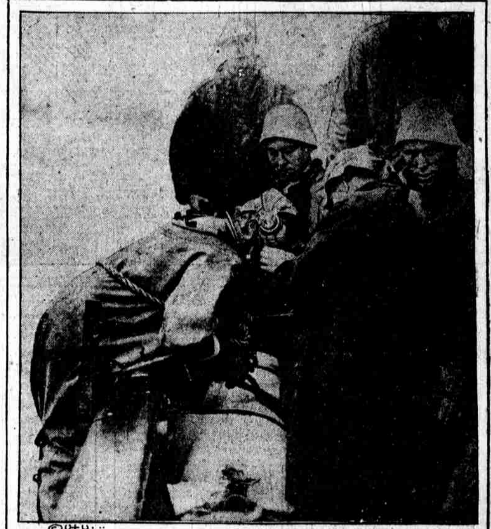
ADJUSTING A submarine telephone on a diver's head on the U. S. S. Pennsylvania so he may keep in communication with shipboard. The Pennsylvania, flagship of the Victory fleet, is now in the Hudson river