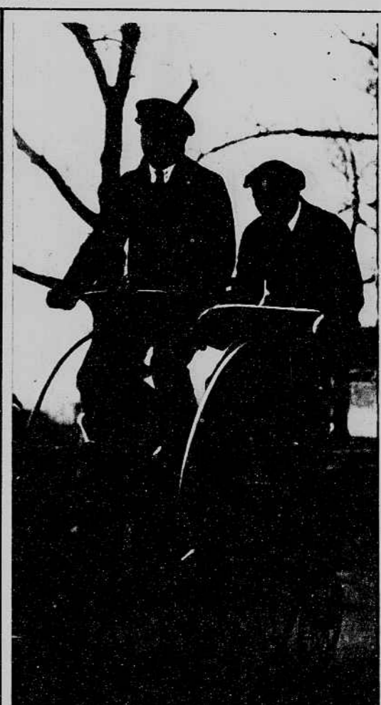
Bicycling certainly is returning to its own, at least in Canada. One Sunday recently some twelve hundred enthusiastic wheelmen in Toronto turned out for an all day run. Here are two of the bike hikers mounted atop the old-fashioned high wheelers that used to be all the rage some thirty years ago. How many of the present generation could negotiate one of these direct drive pushmobiles?