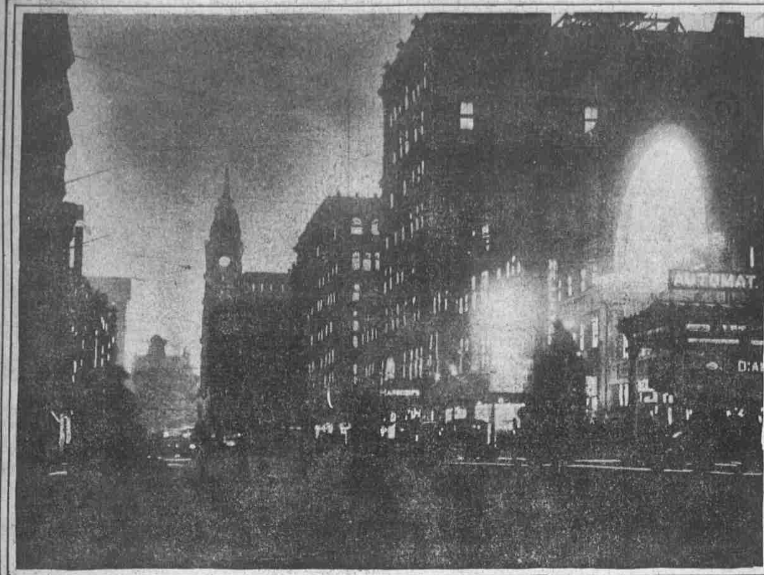
WHEN THE CITY'S LAMP LIGHTERS WERE CALLED OUT AT 3 P. M. The Philadelphia Electric Company was compelled to start up its lights in the afternoon yesterday for the first time in 15 years. The photograph shows how Market street appeared shortly after 3 o'clock.