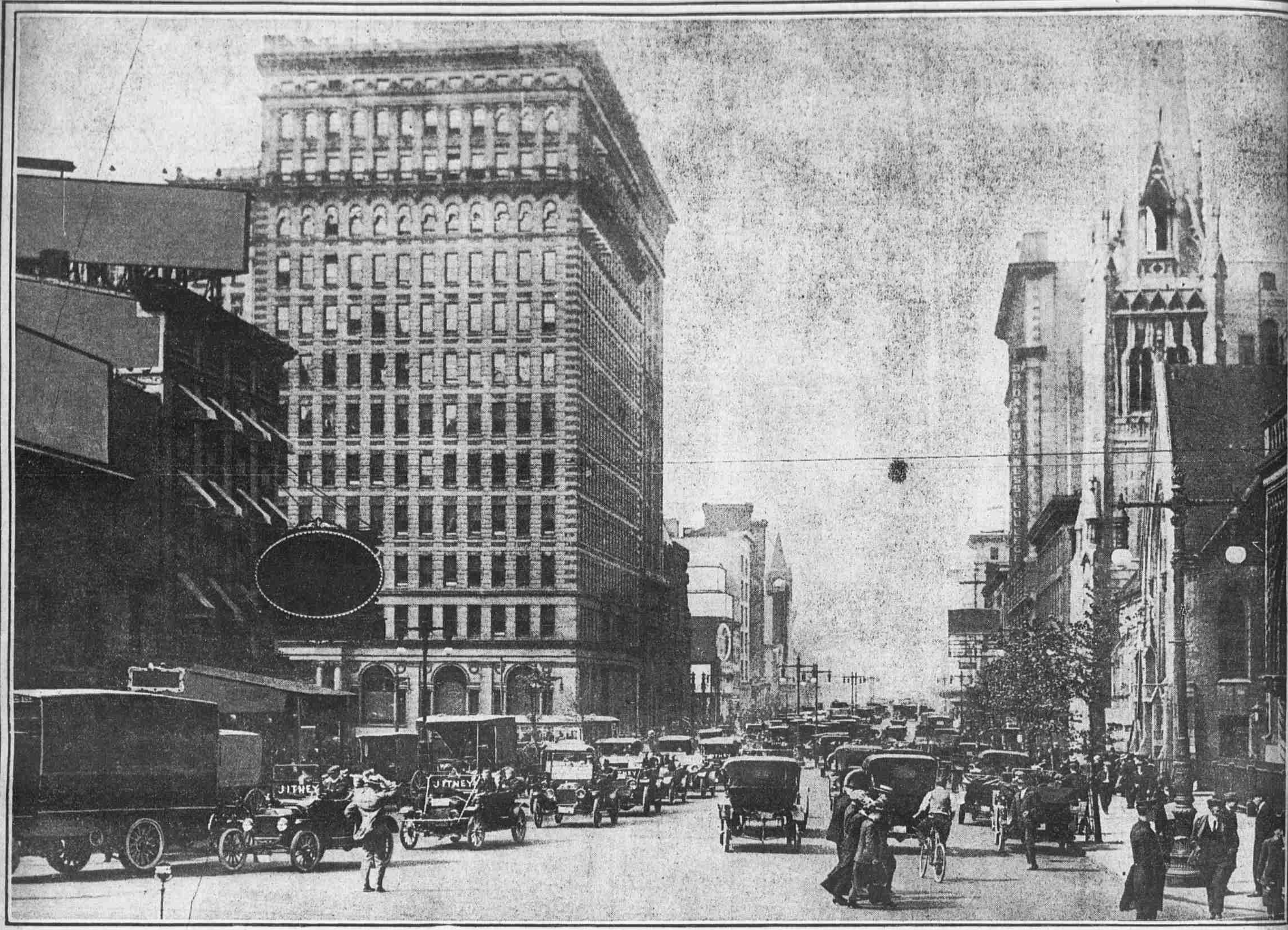
NORTH BROAD STREET TRANSFORMED IN A MONTH BY THE OMNIPRESENT JITNEY BUS

SCENES, EVENTS AND PLACES IN THE DAY'S NEWS OF A BUSY WORLD'S ACTIVITIES