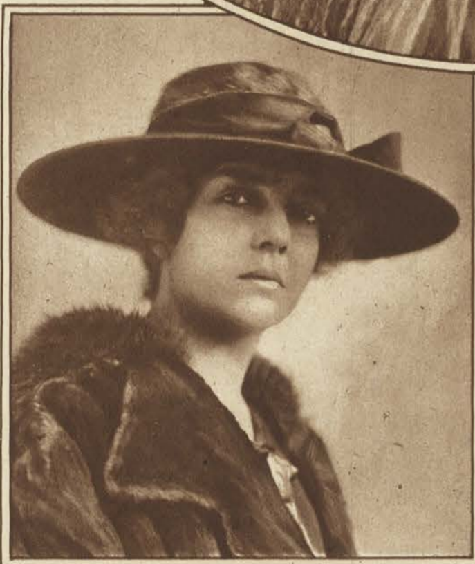
MRS. NICHOLAS LONGWORTH, Who Was Miss Alice Roosevelt, Elder Daughter of the Late Colonel Theodore Roosevelt. From a New Photograph.