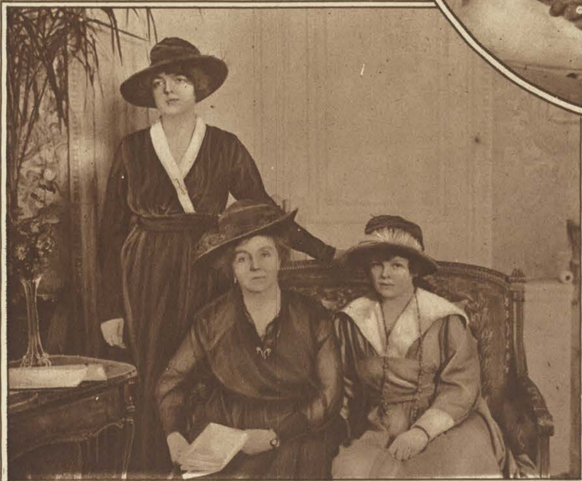
MRS. DAVID LLOYD GEORGE, WIFE OF THE BRITISH PRIME MINISTER, AND THEIR DAUGHTERS, MRS. CAREY EVANS AND MISS MEGAN LLOYD GEORGE. From a Recent Photograph Taken in Paris.