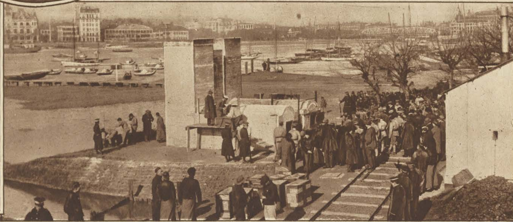
OFFICIALS OF SHANGHAI, CHINA, BURNING AT A SINGLE TIME, IN FURNACES BUILT FOR THAT PURPOSE, OPIUM TO THE VALUE OF $25,000,000, CONVEYED TO THE PLACE UNDER HEAVY MILITARY GUARD.