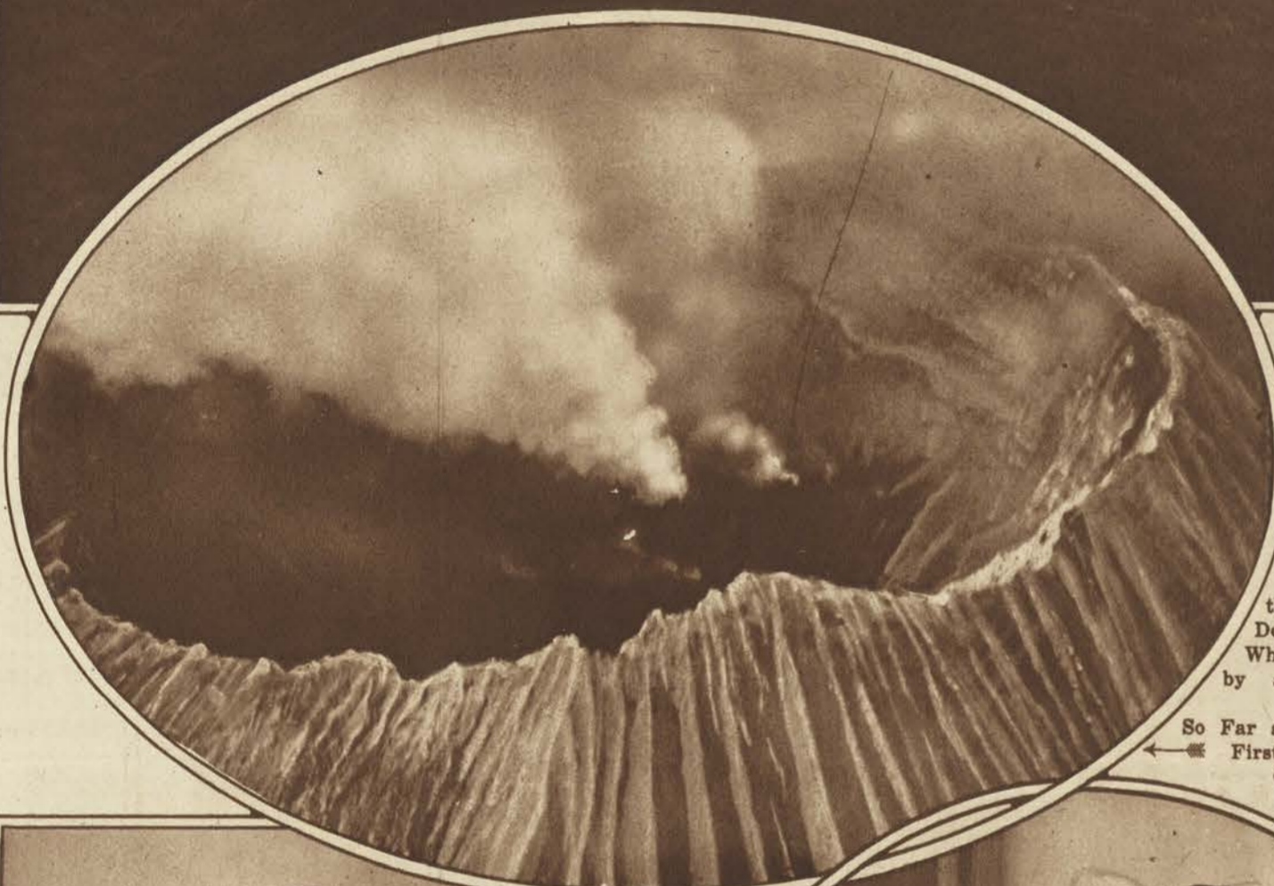
THE CRATER OF MT. VESUVIUS AS PHOTOGRAPHED FROM A HANDLEY-PAGE AIRPLANE IN FLIGHT FROM LONDON TO CONSTANTINOPLE, the Eye of the Lens Dipping Deep Into the Huge Pit, Whose Sides Are Formed by an Immense Shell of Rigid Lava. So Far as Known This Is the First Photograph of This Character Taken from the Air.