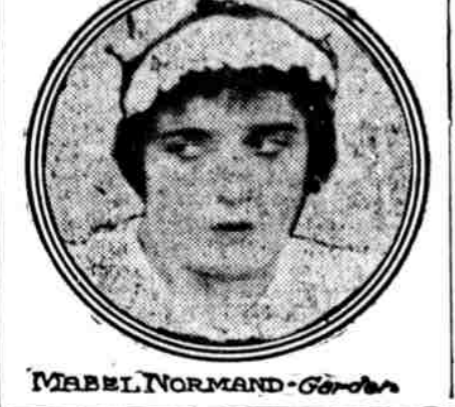
MABEL NORMAND - Grand