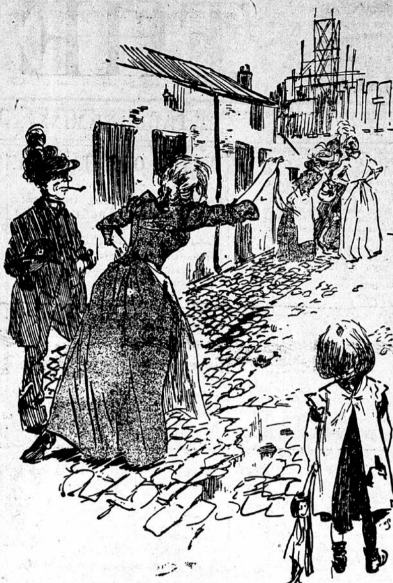
The Victor (waving trophy of hair)—An' now you'd better take yourself off to the o'fficer of the fresh-hair fund.—Pick-Me-Up.