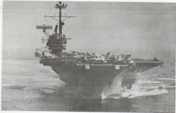
25 Years of Pride In Profile