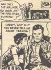
■ AFTER THE WAR, AND SIX...