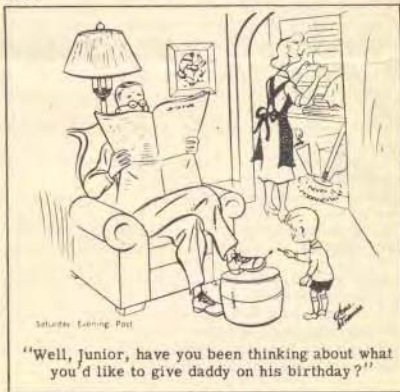
Illustration: Loring Post

Now a boat is something simple which by oars can be propelled. It's a craft for lakes and rivers and by foe it's never shelled. It is swung on ships in davits, and at times in storms at sea Should the nobler vessel founder, very useful it can be, But from the cabin boy to skipper you'll get every sailor's goat And he'll never quite forgive you if you call his ship a "boat."