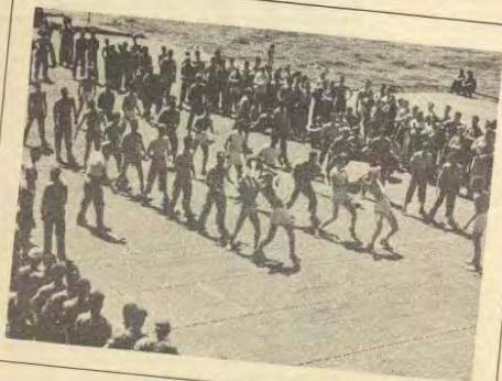
MEDICINE BALL RELAY RACE Spring Dance!