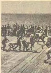
LEAP F Jitter