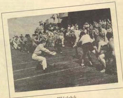
PULL-L-L-L Note the moral support!