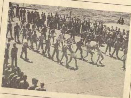
MEDICINE BALL RELAY RACE Spring Dance!