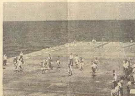
LAST LAP OF THE RELAY RACE Isn't war hell?