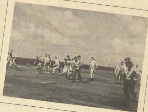
PONY RACE Hey, look at us!