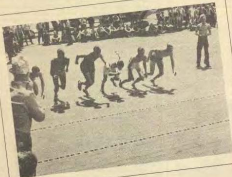
START OF THE 440-YARD DASH Gone Native!