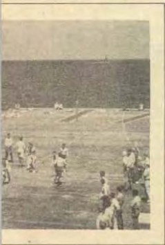
THE RELAY RACE r hell?