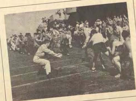
PULL-L-L-L Note the moral support!