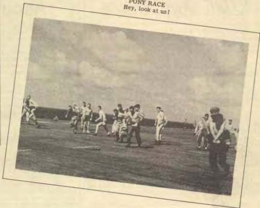
PONY RACE Hey, look at us!