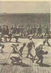
FROG RACE bugs!