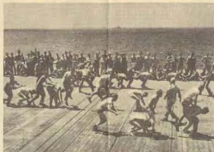
LEAP FROG RACE Jitterbugs!