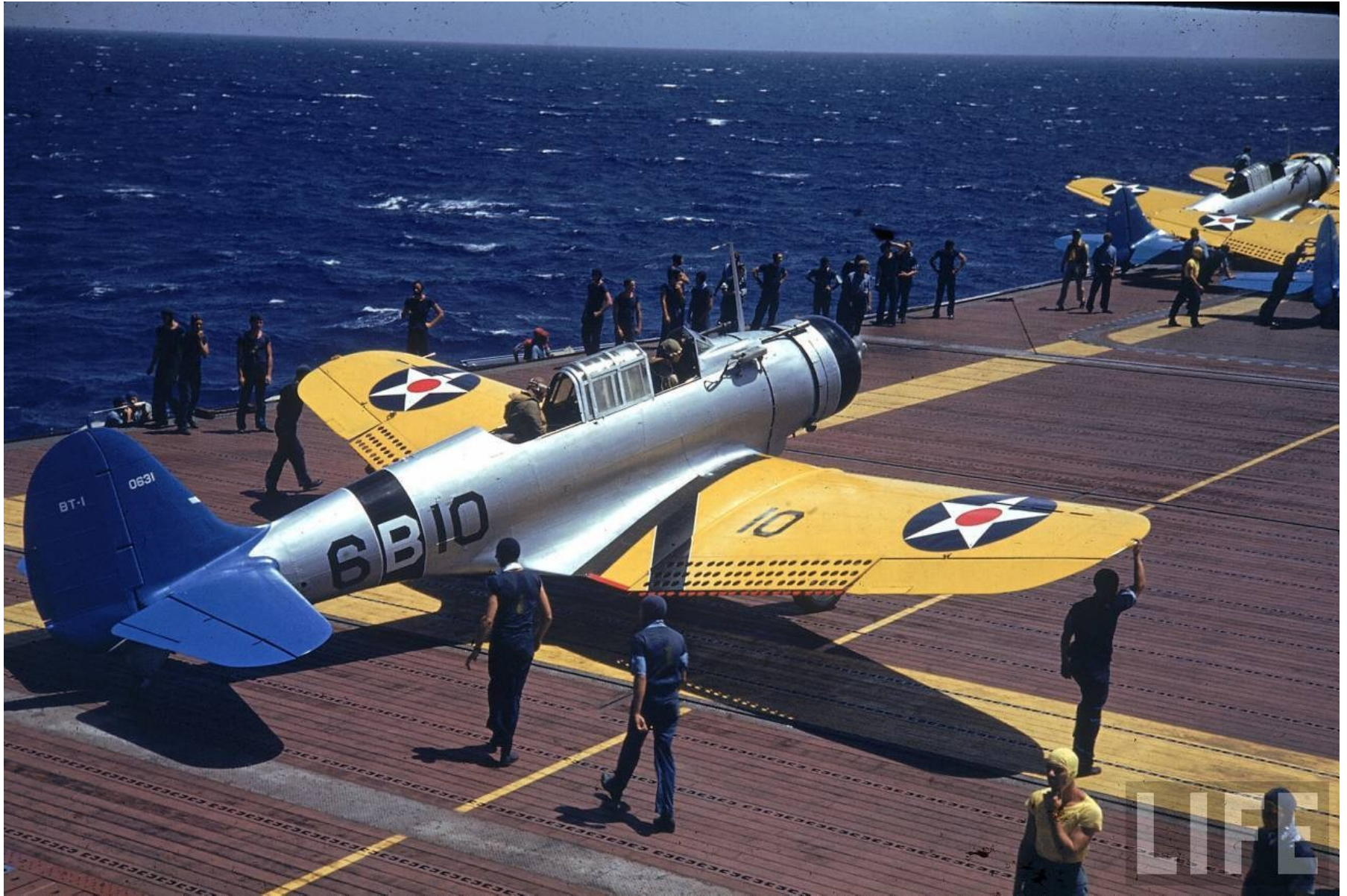
Northrop BT-1 dive bomber, # 0631.