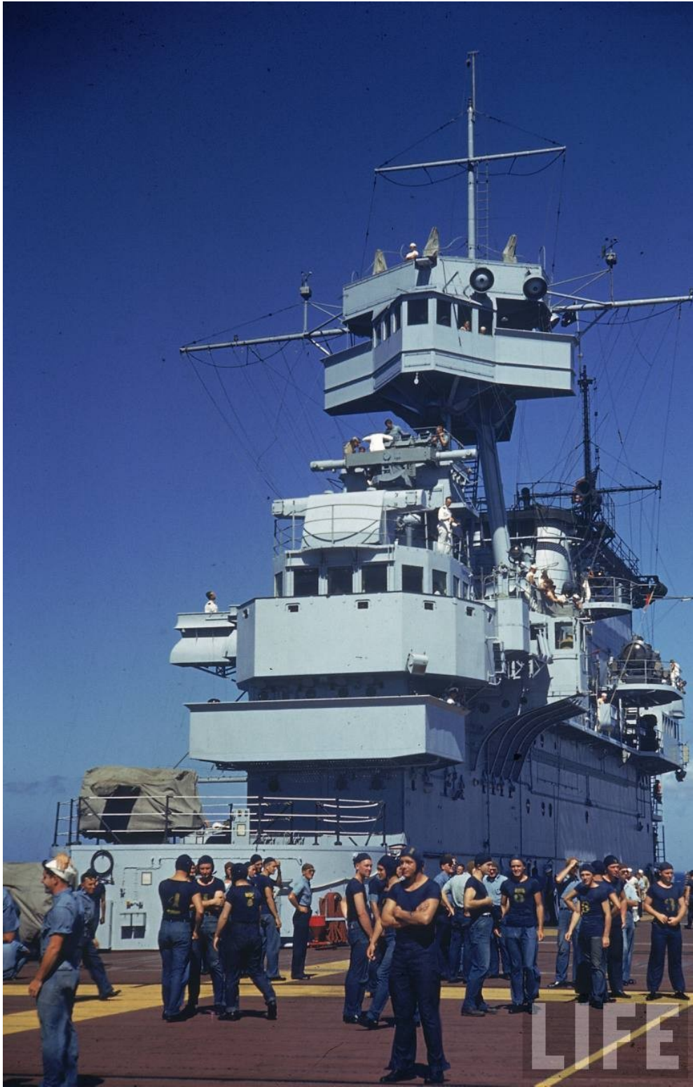
Flight crews awaiting return of planes aboard the aircraft carrier USS Enterprise (CV-6), 1941.