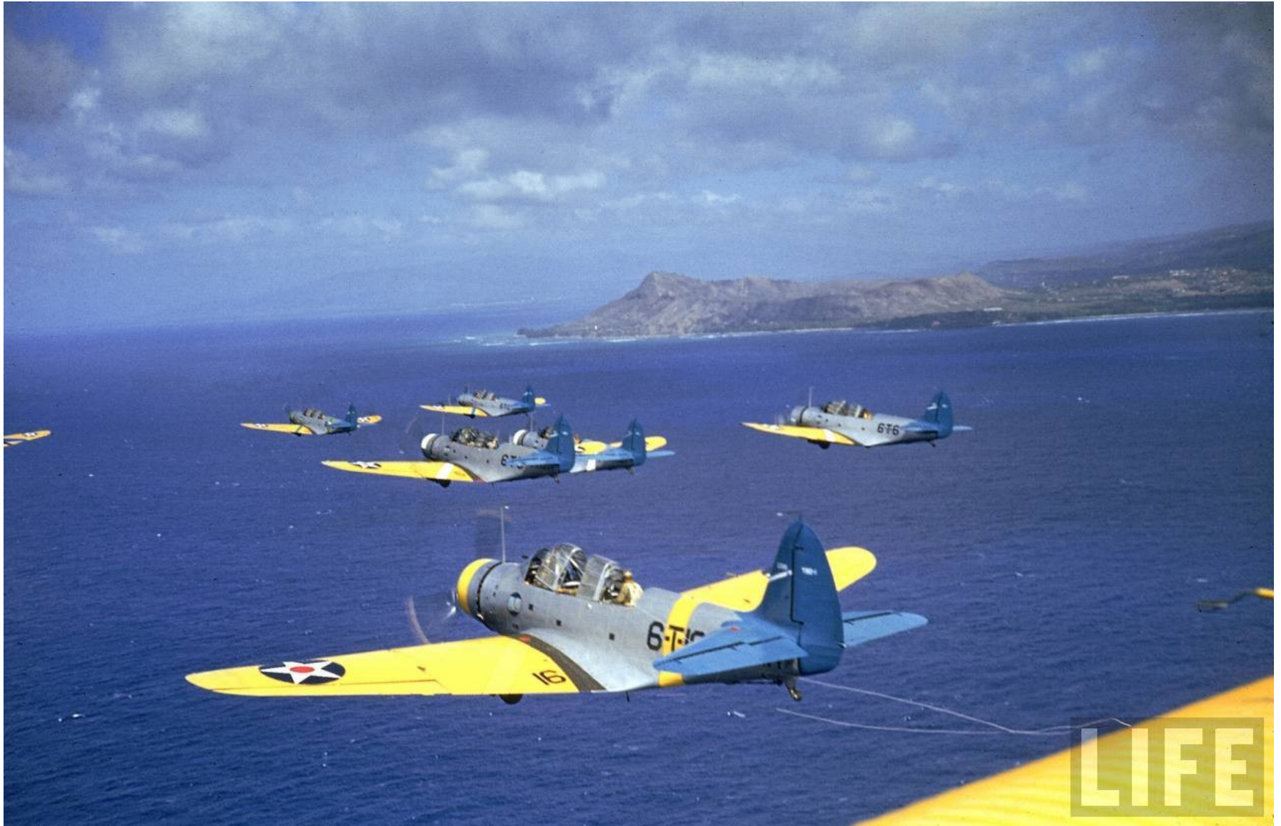
Squadron of American Douglas TBD Devastator torpedo bombers from the aircraft carrier USS Enterprise (CV-6) in flight near Diamond Head prior to WWII.