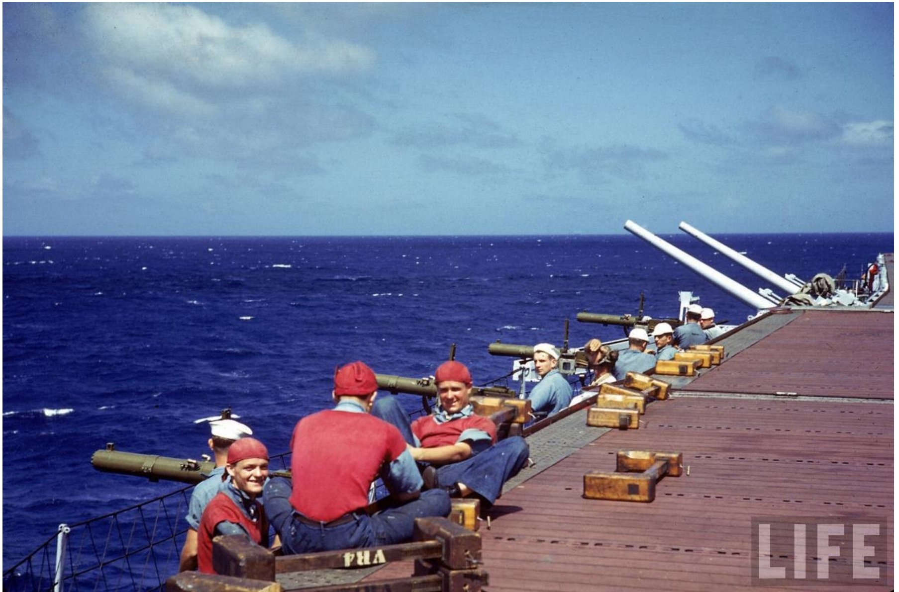
March 1941—Relaxed shot of crewmen aboard the American aircraft carrier USS Enterprise (CV-6).