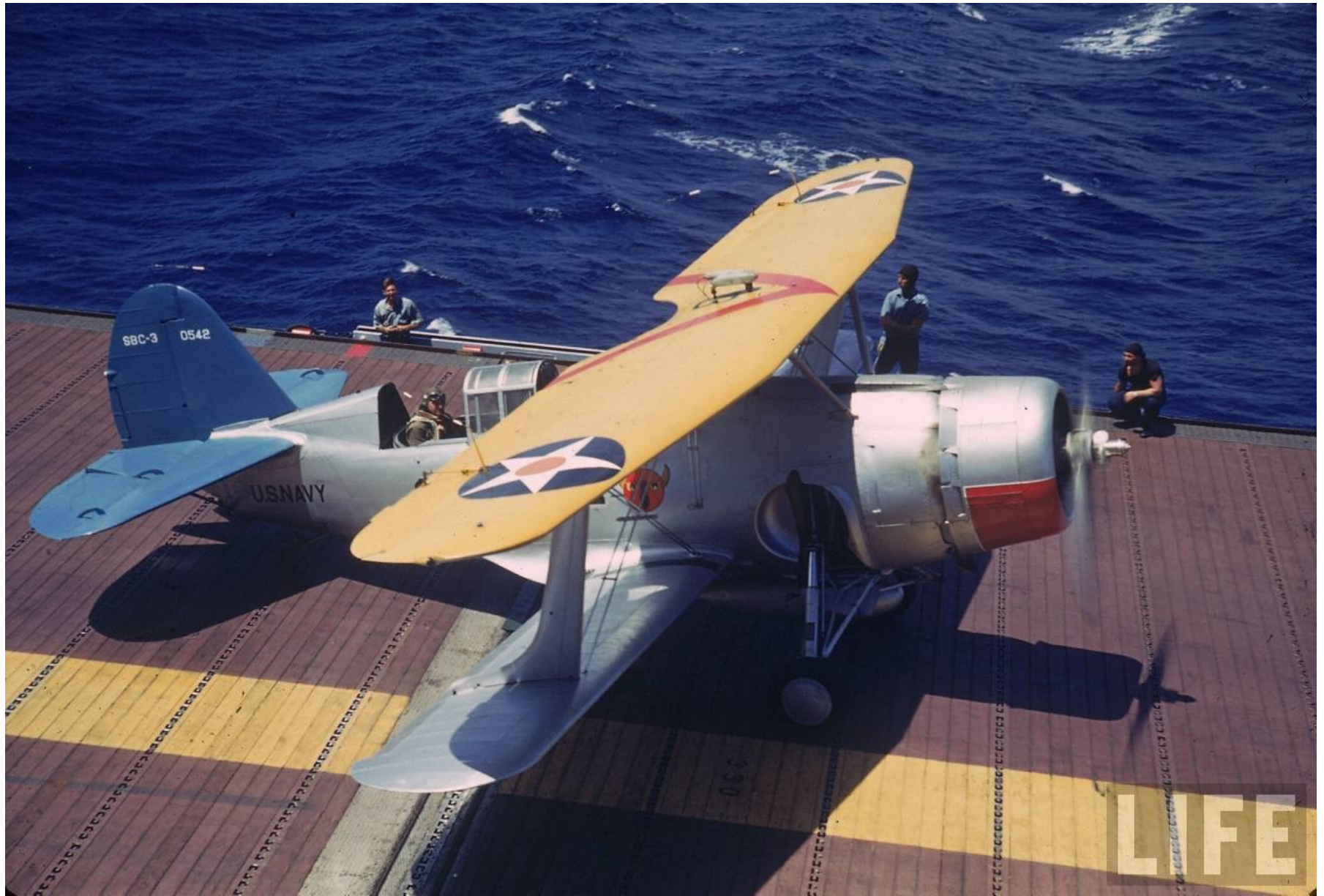
SBC-3 Helldiver scout plane (# 0542) preparing for carrier launch during US Navy maneuvers off the Hawaiian Islands. 1941