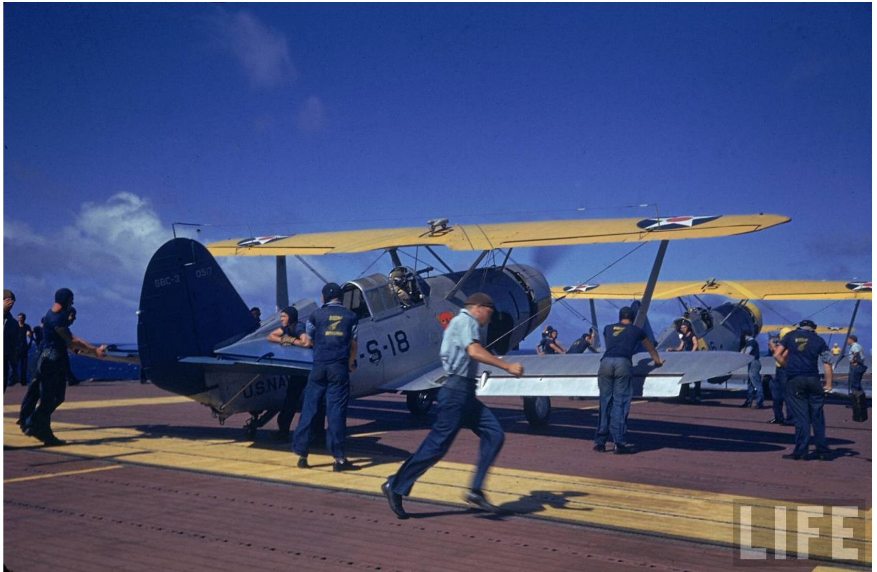
Curtiss SBC-3 Helldiver scout-dive bombers being readied for takeoff from the aircraft carrier Enterprise (CV-6) during the US Navy's Pacific Fleet maneuvers around Hawaii.