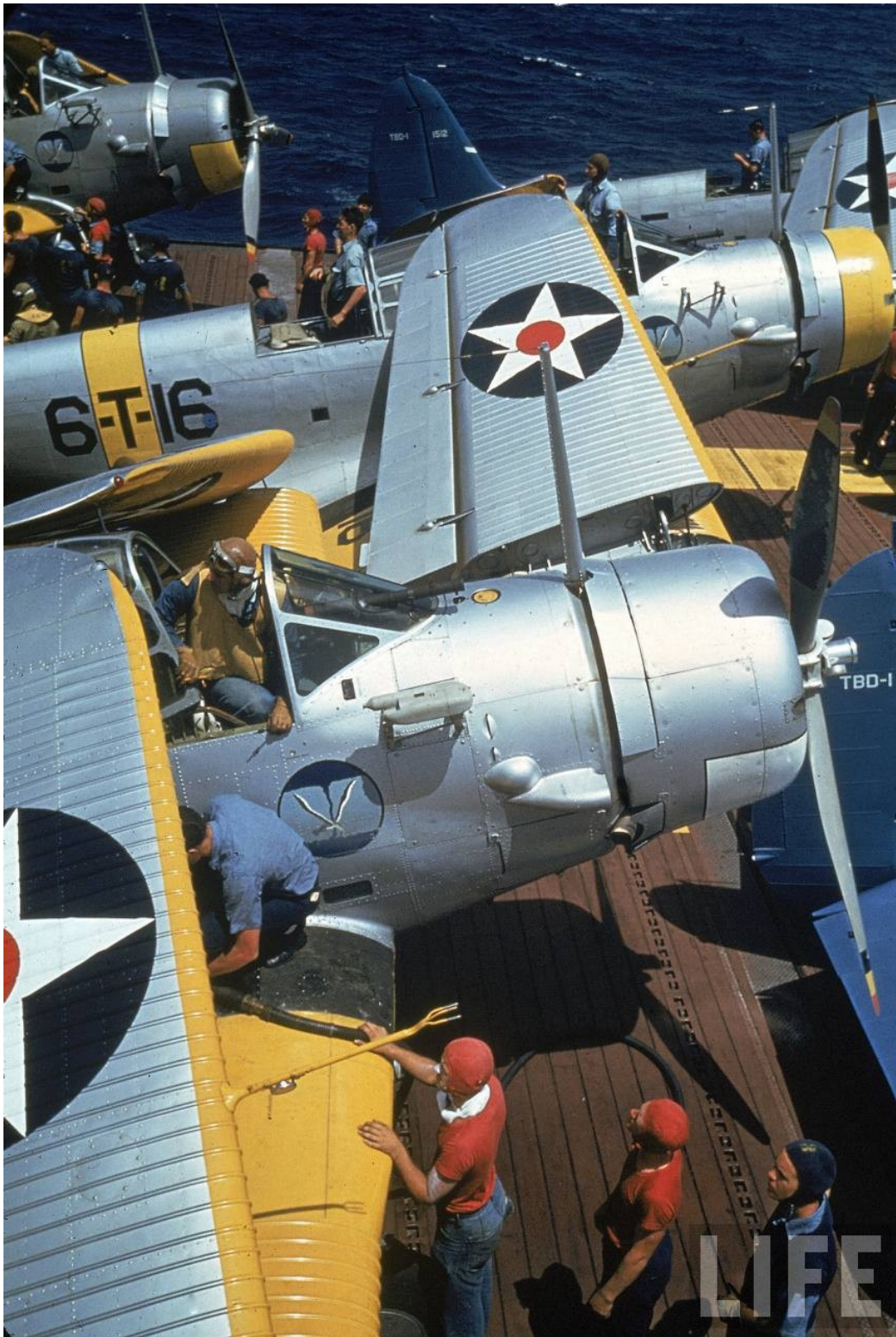
Crew of the American aircraft carrier USS Enterprise (CV-6) servicing SBC-3 Helldiver dive bombers on deck during maneuvers off Hawaii.