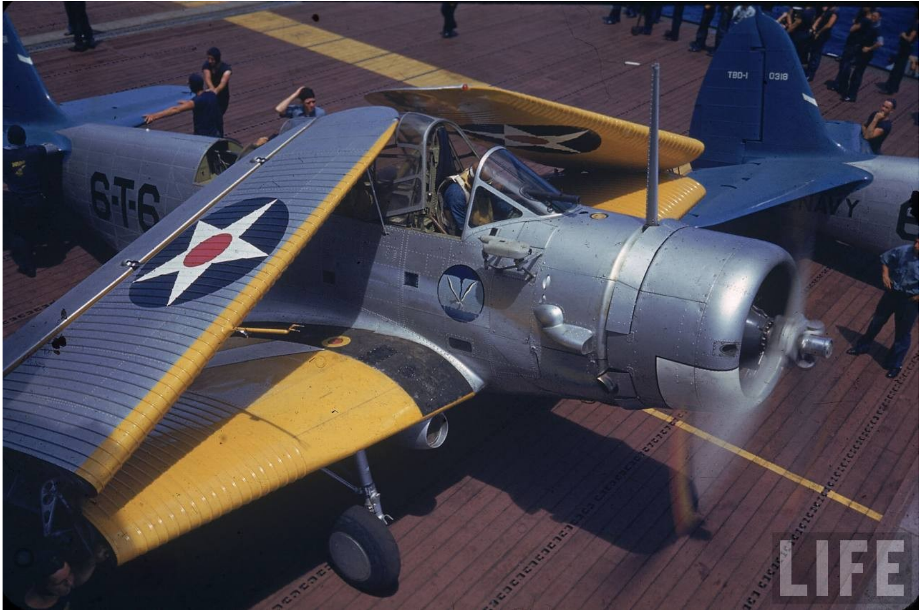
TBD Devastator torpedo bomber with folded wings aboard the aircraft carrier USS Enterprise (CV-6). For educational, non-commercial use.