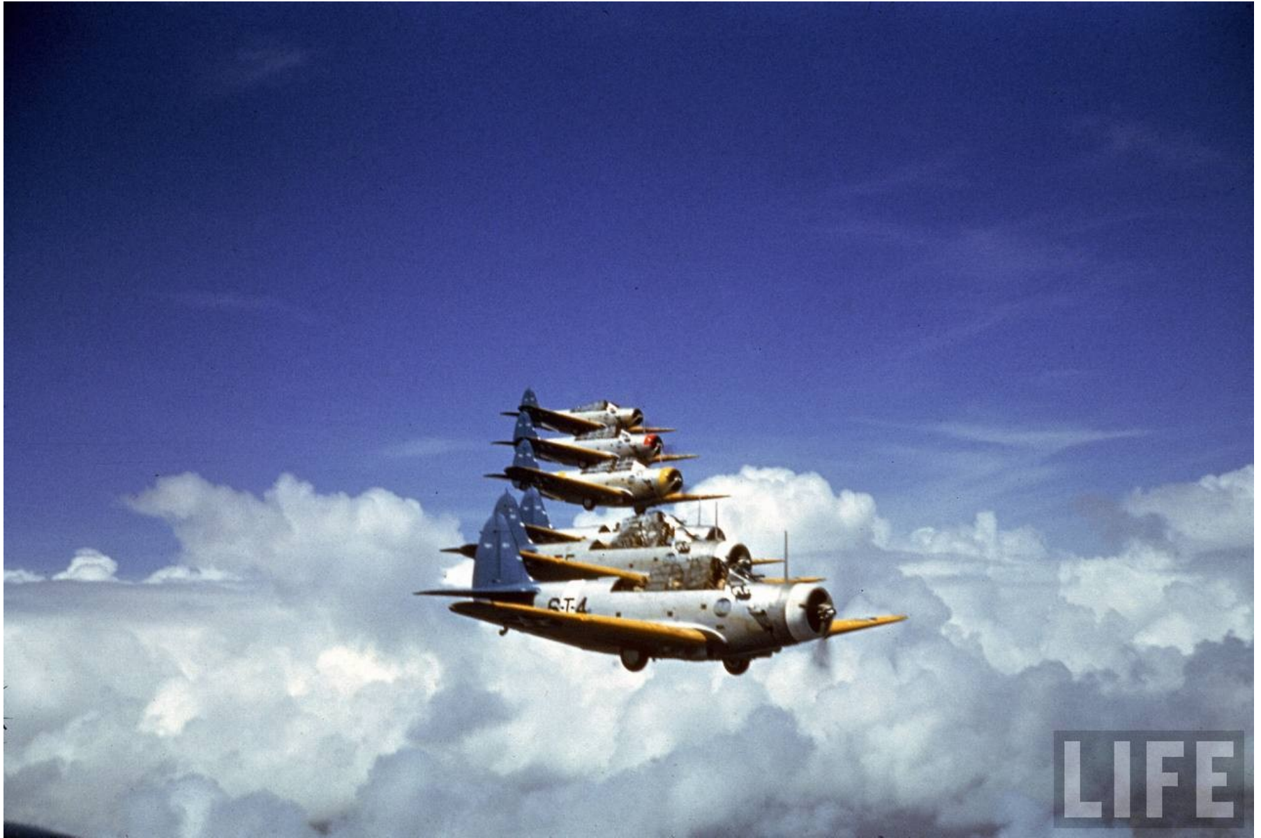
Squadron of Douglas TBD Devastator torpedo bombers in flight during the US Navy's Pacific fleet maneuvers.