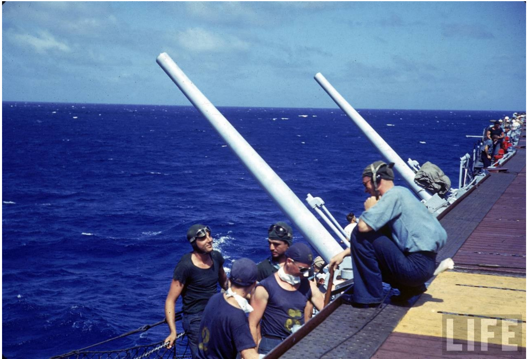
Gun crew aboard the aircraft carrier USS Enterprise (CV-6) relax during US Navy's Pacific Fleet maneuvers near Hawaii, 1940.