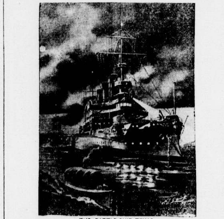
THE BATTLESHIP TEXAS. BY ASSOCIATED PRESS. New York, Feb. 18.—The United States battleship Texas crossed the bar early this morning on the way up the river. She was loudly cheered on all sides as she steamed away, and the scene was one in which spontaneous and involuntary enthusiasm played a marked part. The Texas made a fine appearance and her progress was majestic and imposing.