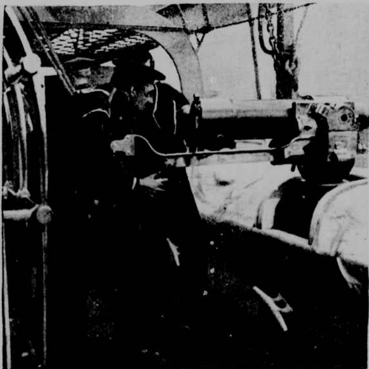
SIGHTING THE RAPID-FIRE GUNS ON BOARD THE PURITAN.