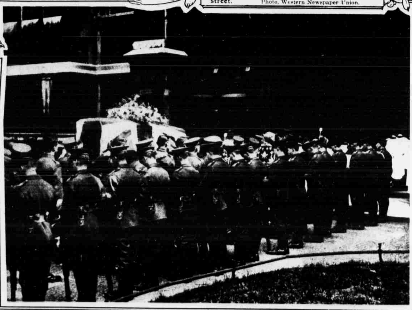
Carrying the coffin of Miss Cavell into Westminster Abbey, where a most impressive funeral service was held. Military honors were paid and the streets were literally lined as the procession passed. Seldom has such honor been given to a woman's memory.