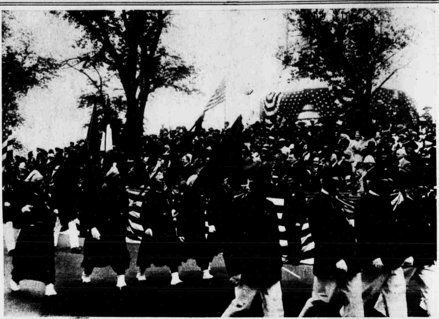
The Memorial Day parade was more impressive than ever this year because of the presence in line of veterans of three conflicts, the Civil War, the Spanish War and the World War. This photograph shows the Zouaves passing the reviewing stand on Riverside Drive.