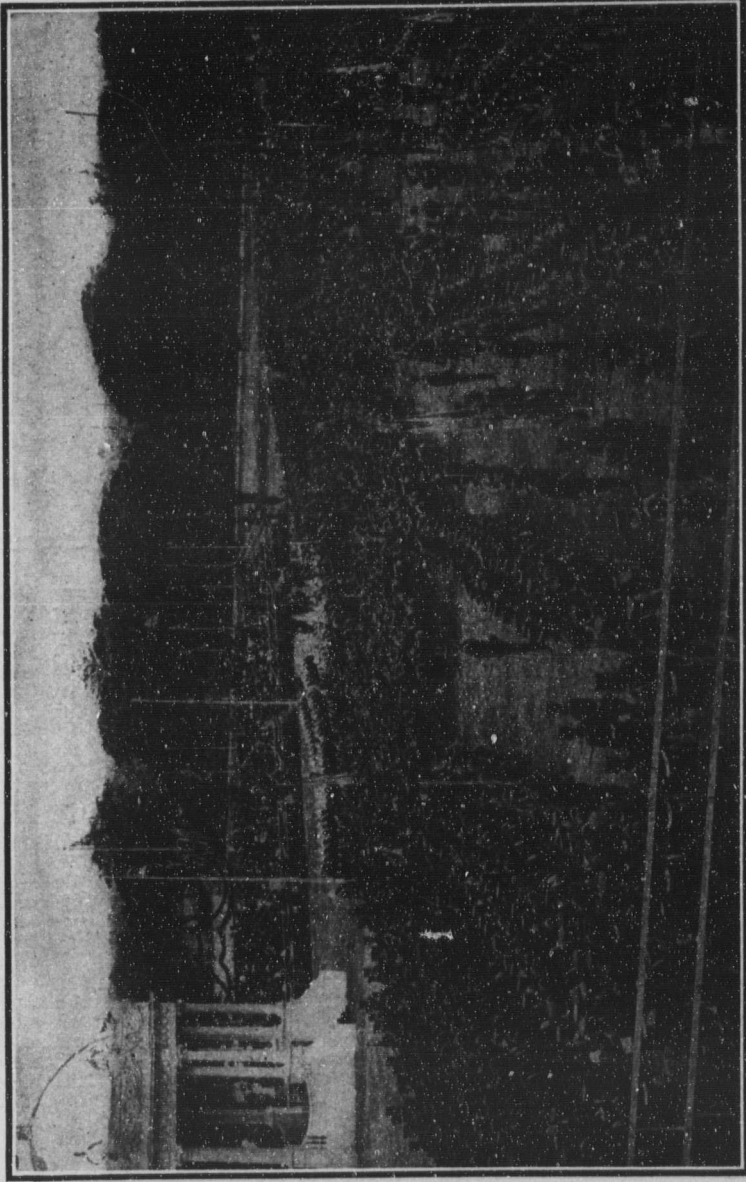
SYDNEY RECEPTION TO AMERICAN OFFICERS AND SAILORS IN THE "DOMAIN," ONE OF THE MOST IMPRESSIVE FEATURES OF THE TRIP.