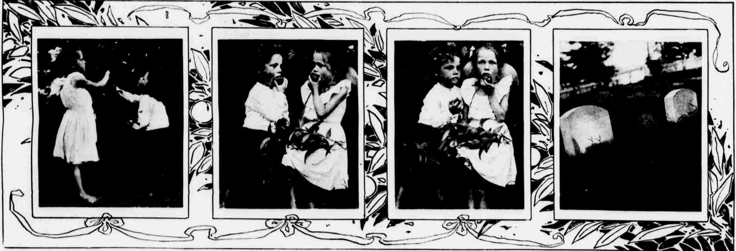
A little peach in an orchard grew, A little peach of emerald hue

them to use wood in any form in the con-French Canet type and have practically the bulkheads in all the living spaces and the entire interior is sheathed with the same fireproof material. Even its boats will be of metal, a step which has not been taken by the United States yet, though the newer There are four 12-inch, twelve 6- ships have precious little wood about them.