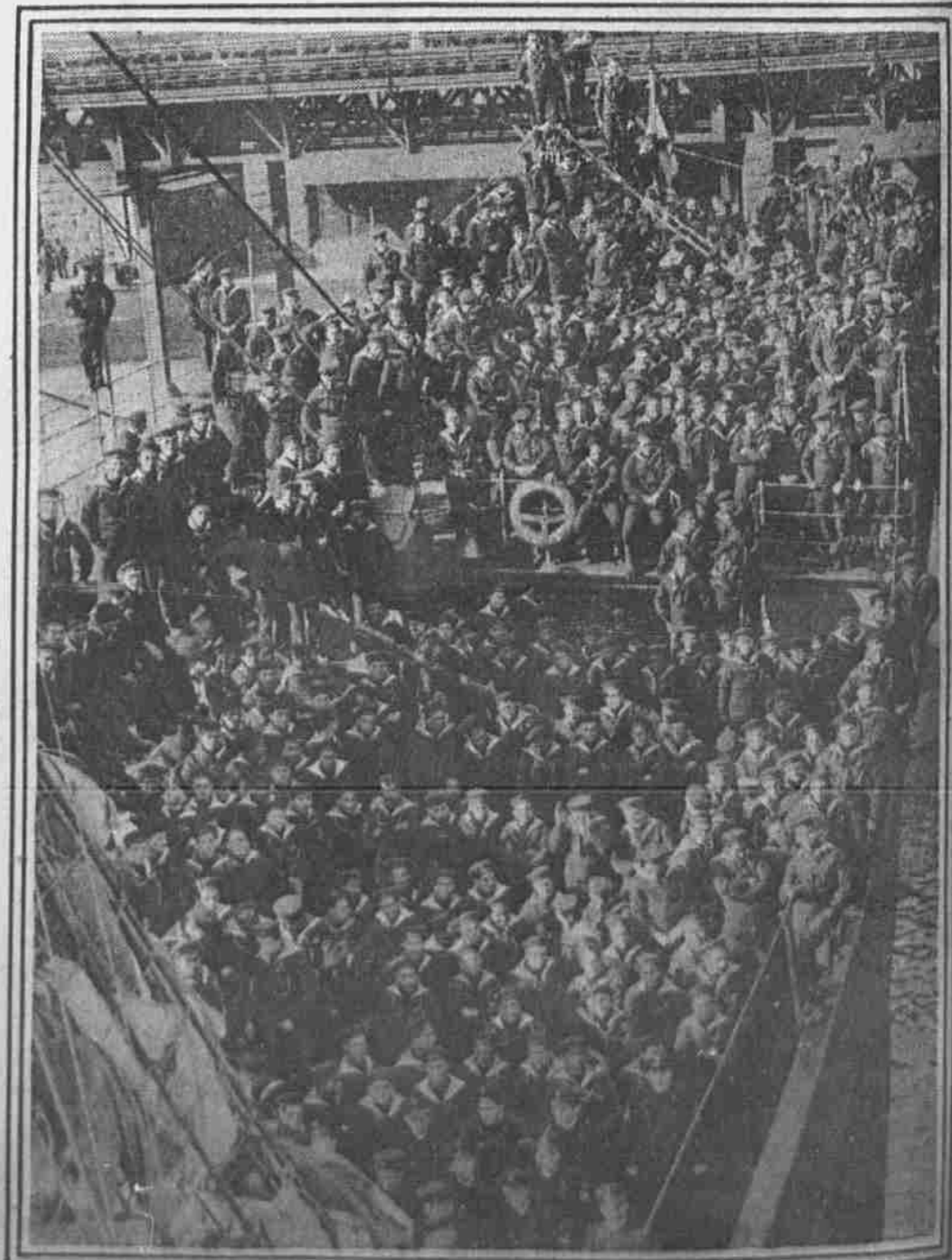
800 MEMBERS OF THE CREW OF THE MORENO They are quartered here on the transports Chaco and Patopas, while they wait to occupy their posts on the new warship. Most of them are men of small but wiry build. A number came from inland towns and are of Indian blood.