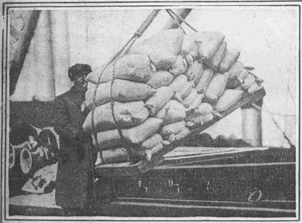
LOADING FLOUR HERE TO FEED THE BELGIANS The steamer South Point, which came to take on this cargo, was held up in loading by a strike, but has obtained a new force of stevedores to handle the thousands of bags of flour donated by the millers of the Northwest.