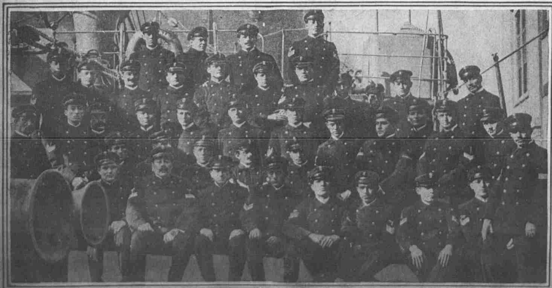
HERE TO CLAIM ARGENTINE DREADNOUGHT Fifty naval officers from the South American republic have arrived to take charge of the battleship Moreno, now being finished in the New York Shipbuilding Company's yards in Camden. They are graduates of the Naval Academy at Buenos Aires.