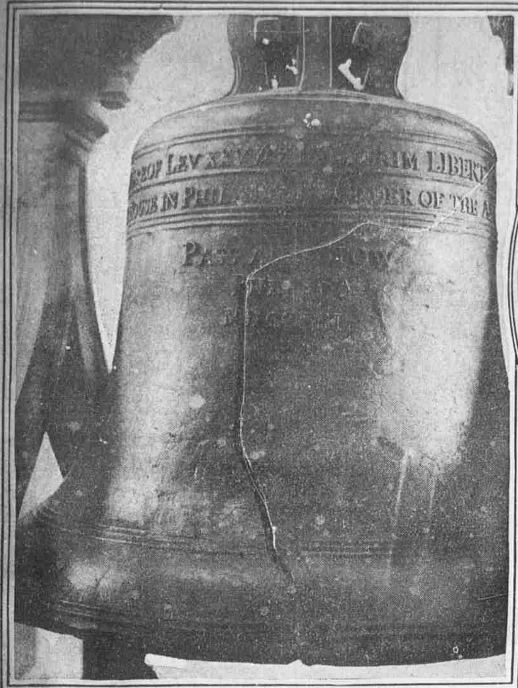
HOW THE LIBERTY BELL CRACK IS EXTENDING For years this famous fissure remained in its perpendicular line a little more than half way up the side, then almost imperceptibly it extended itself up to the upper row of lettering at an angle. Now the grains of metal are separating until the fissure threatens to extend half way around the bell.