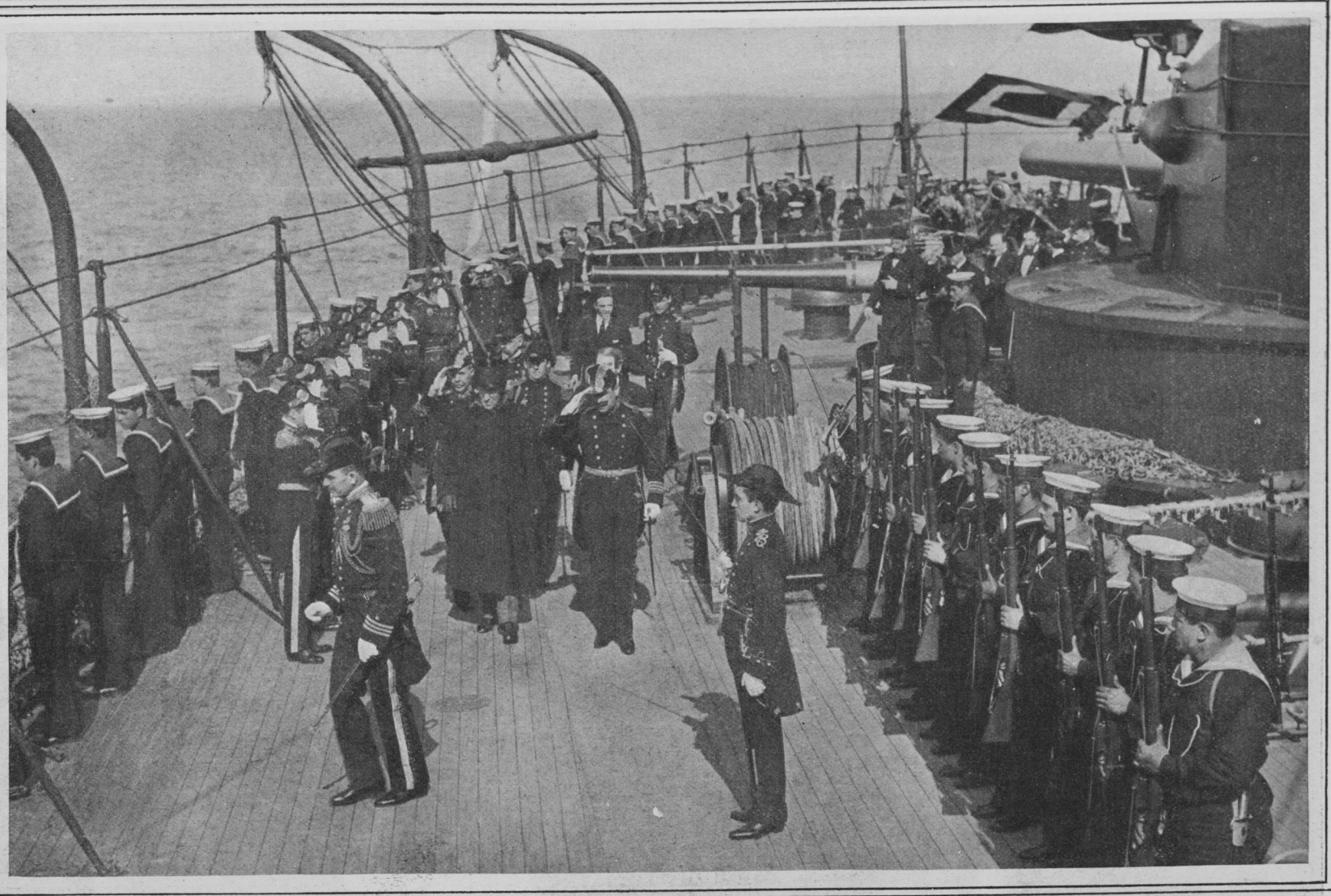
PRESIDENT WILSON ON BOARD THE ARGENTINE BATTLESHIP MORENO, OFF ANNAPOLIS, AS GUEST OF ARGENTINE AMBASSADOR NAON.