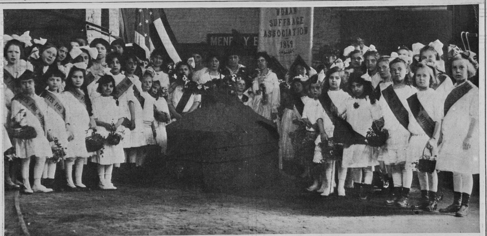
MOLDING THE PENNSYLVANIA WOMEN'S 'LIBERTY BELL' AT TROY, N. Y. Suffragists and Children Gathered About the Freshly Poured Metal of the Bell Which Will Not Ring Until Pennsylvania Women Get the Vote.