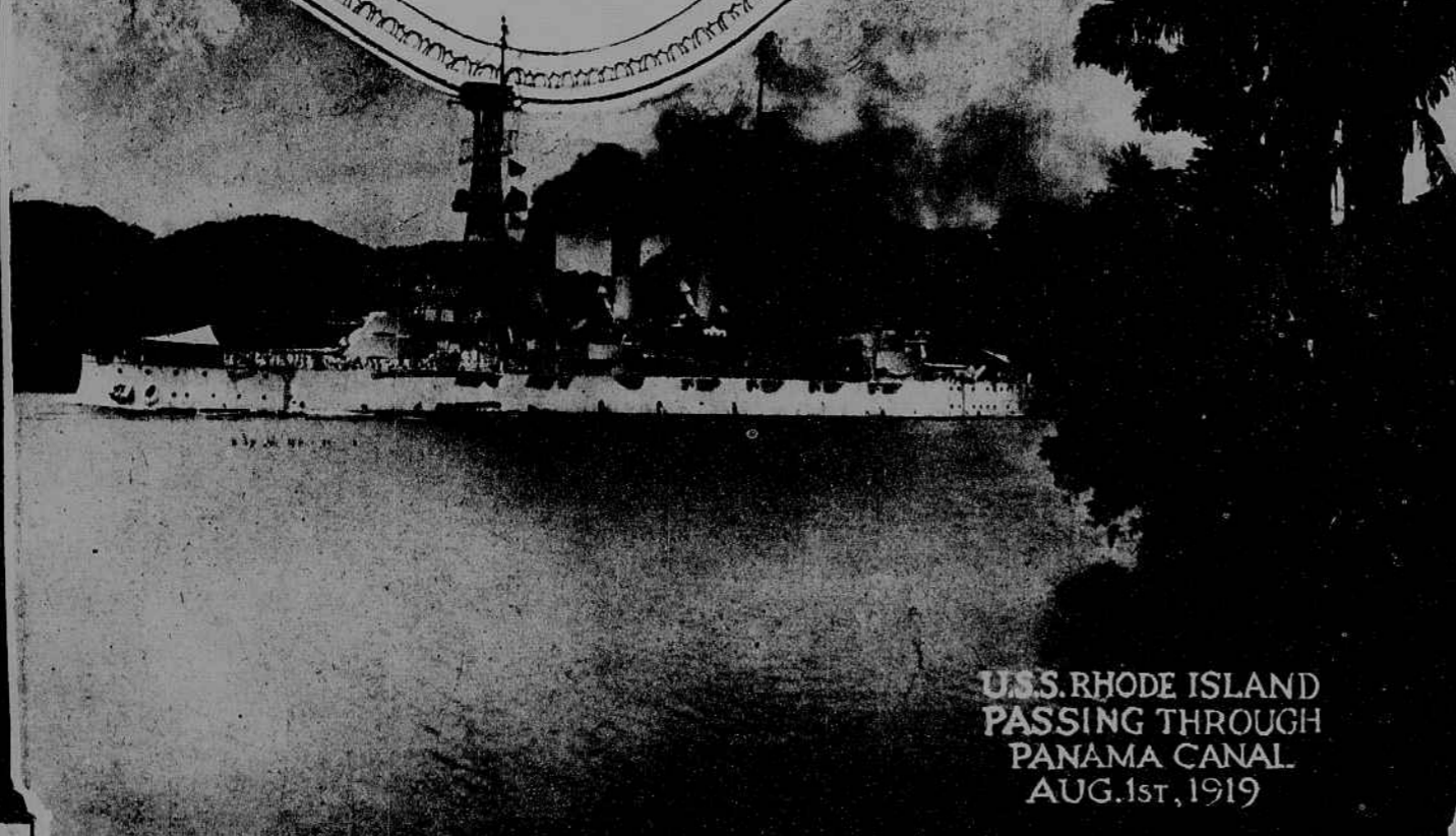
U.S.S. RHODE ISLAND PASSING THROUGH PANAMA CANAL AUG. 1st, 1919

Thos. Cook & Son, 215 N. W. Ave., 501 5th Ave., New York