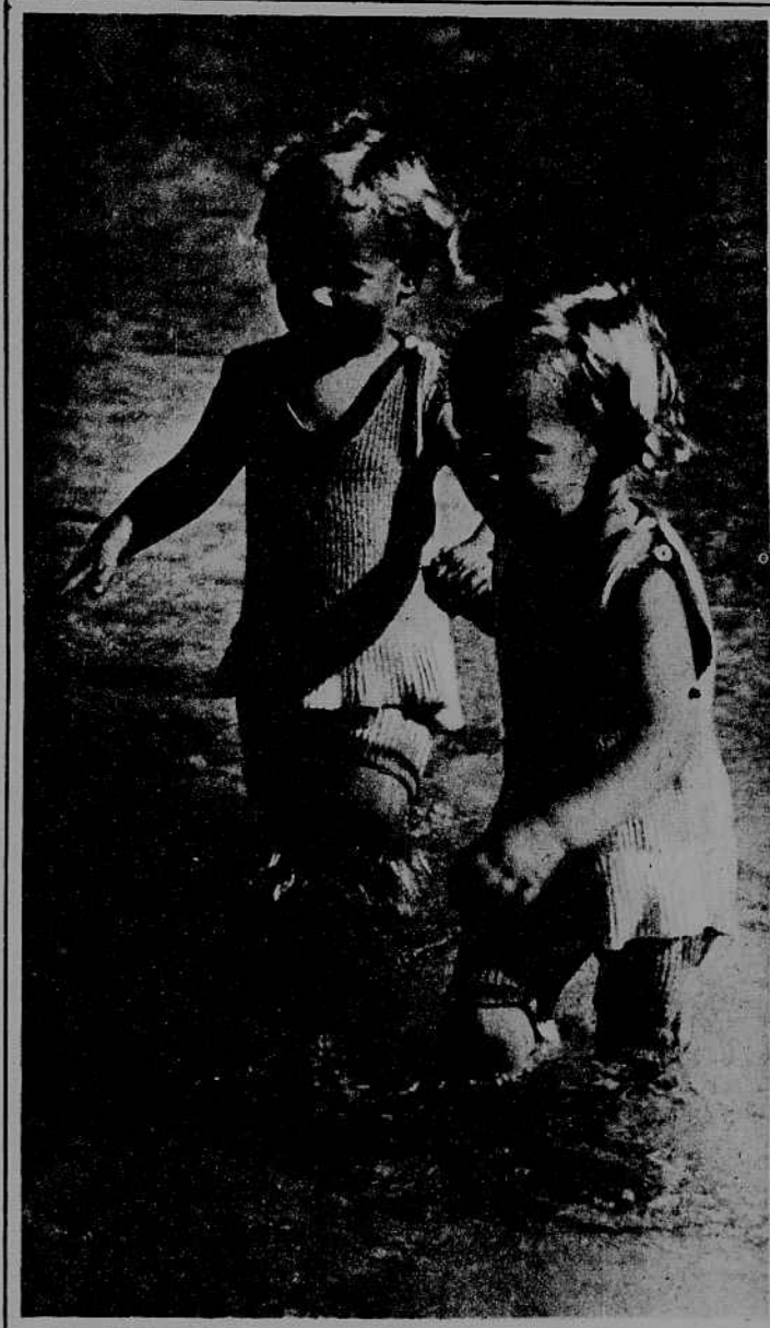
"Come on in, the water's fine." No fear of the big blue ocean have these lucky youngsters who spend their winters at Palm Beach, Florida's fashionable playground for both young and old.

NEW YORK • BOSTON • PHILADELPHIA • CHICAGO • SAN FRANCISCO • LOS ANGELES • MONTREAL • TORONTO