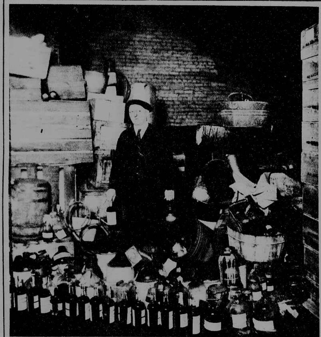
SOME CELLAR! But there's little use trying to get friendly with the fellow who owns it. His name is Uncle Sam. But we don't mind telling you where this quarter of a million dollars' worth of hooch is cached. In the Federal Building, Cincinnati. Everything from "poison dew" to real Scotch, all seized from Ohio bootleggers.