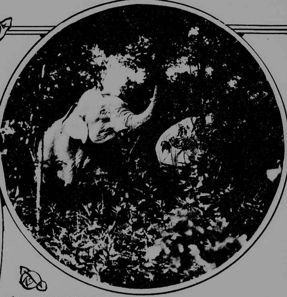
IN THE JUNGLES OF MANHATTAN. Why go to India for big game? Here's an honest-to-goodness photograph taken recently in our own Central Park, with two trumpeting elephants crashing through the "forest primeval." But the big pachyderms aren't on a wild rampage. They're just taking an afternoon off from their exacting duties at the Hippodromes.