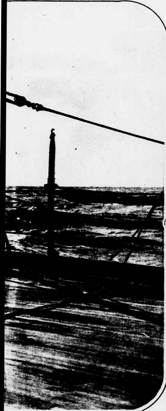
of the U. S. S. Oklahoma as it