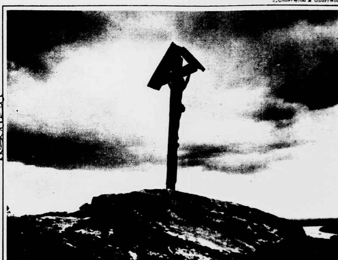
Wayside Calvary on the Hill of Justice, Austrian Tyrol. This section of territory has been given to Italy by a treaty growing out of the war.