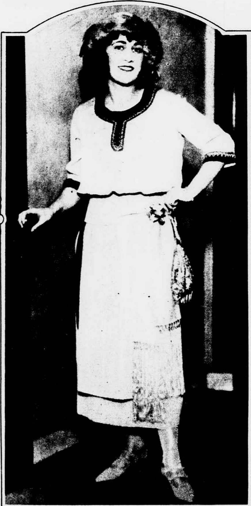
The "Moral Gown," according to fifteen ministers. It was designed by clergymen representing fifteen denominations in Philadelphia. The frock is formed of a non-diaphanous material, reaches within three inches of the wearer's throat and the hem is seven and one-half inches from the floor.