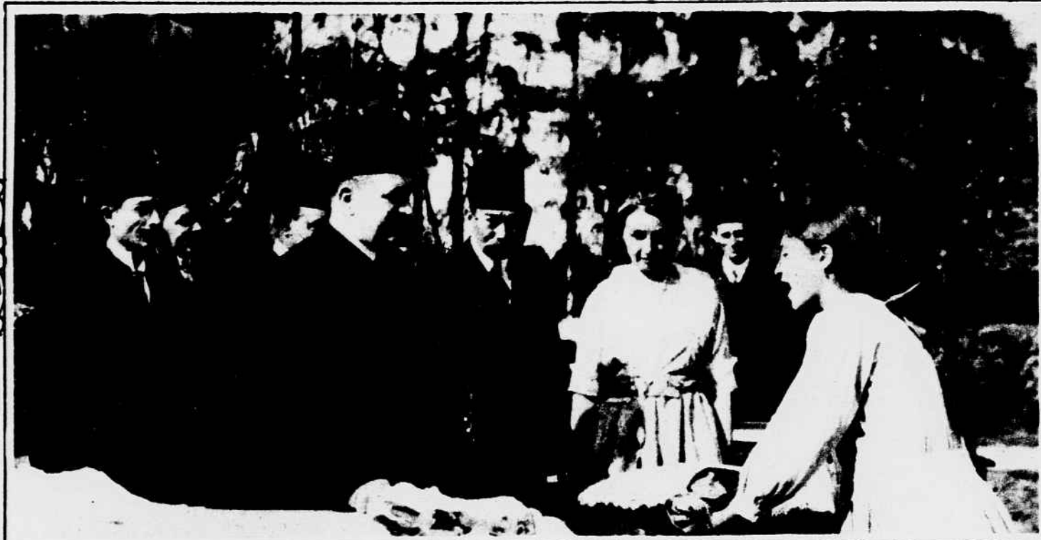
Sultan Feroud Pasha of Egypt takes a look over his own country, and at Shebin-El-Kem a schoolgirl gives him a present. The sultan was selected ruler of Egypt by Great Britain in 1917, under the British protectorate.