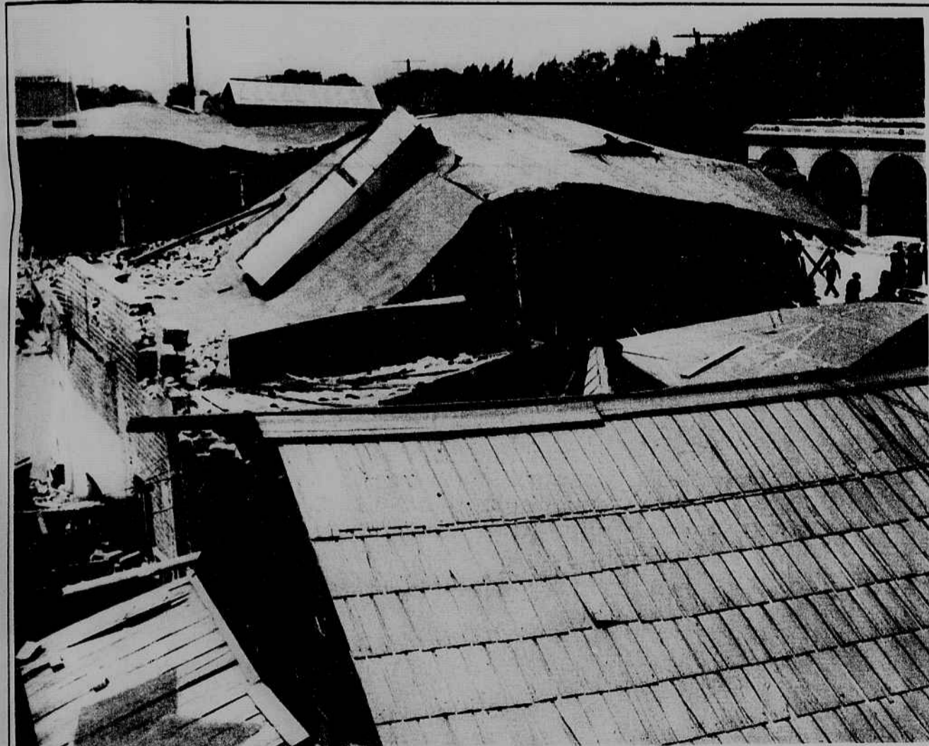
The earthquake in California—Bird's-eye view from the top of the San Jacinto Postoffice Building looking down Main Street.