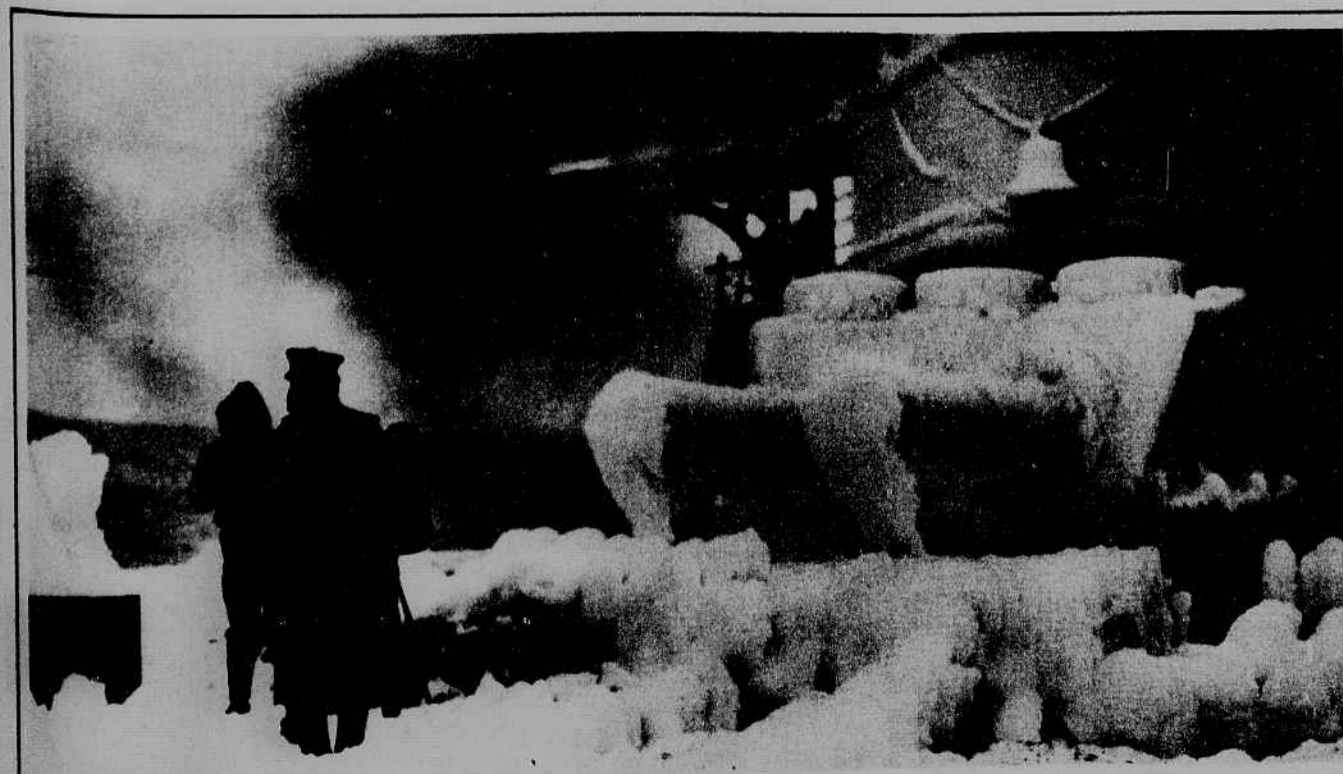
What our battleships had to contend with in winter seas.