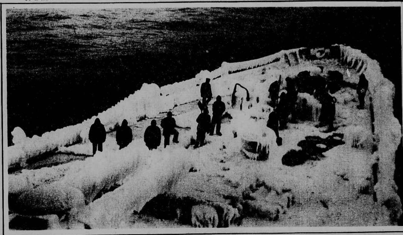
Part of the crew of an American battleship busy clearing away the frozen spray that covered the decks and the big guns.