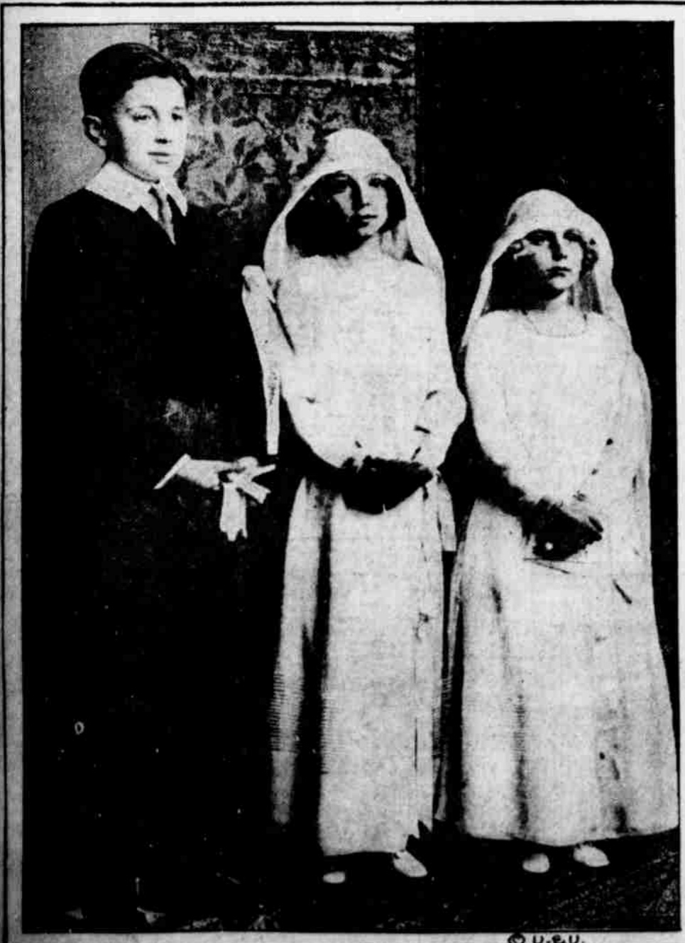
THE CHILDREN OF THE KING AND QUEEN OF SPAIN about to receive their First Communion in the Royal Palace in Madrid. From left to right are the Infante Jaime and the Infantas Beatrice and Maria Christina of Spain.