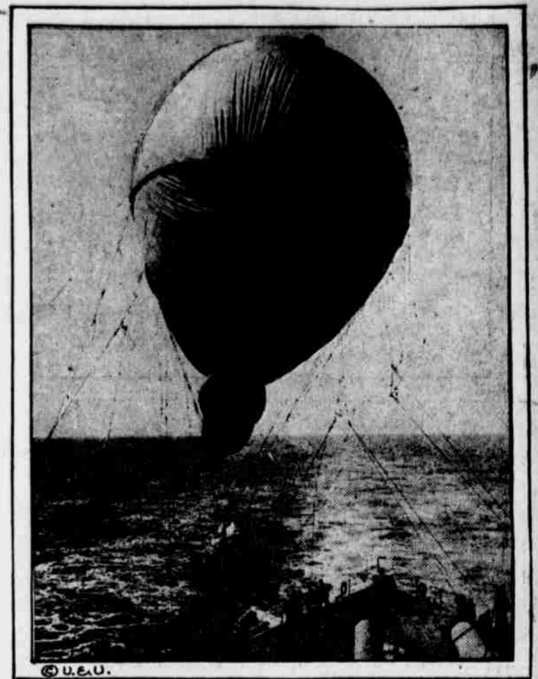
LAUNCHING AN OBSERVATION BALLOON from the deck of a battleship at sea.