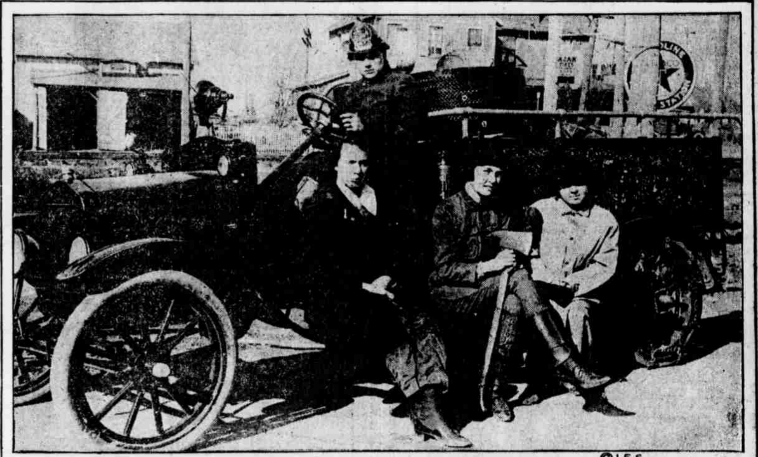
CLARENDON, VA., BOASTS of being the birthplace of the first women's fire department. A little cottage in the town burned down because the men were too busy elsewhere to take out the apparatus. So the women of the town decided to study the workings of the fire-fighting apparatus, and never again to permit a house to burn down while they were around.