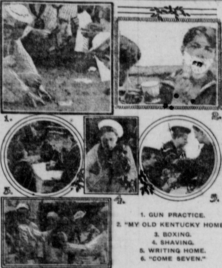
1. GUN PRACTICE. 2. "MY OLD KENTUCKY HOME." 3. BOXING. 4. SHAVING. 5. WRITING HOME. 6. "COME SEVEN."

Would you like to take a cruise around the world without the expense of a son's mark?