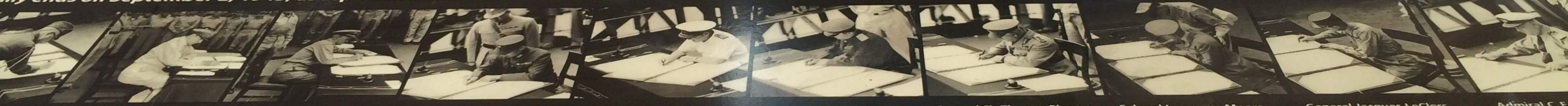
General Douglas MacArthur signs at 0908 as Supreme Commander for the Allied Powers

ally ends on September 2, 1945, as representatives of the warring nations gather aboard USS Missouri in Tokyo Bay to sign an agreement by which peace may be rest