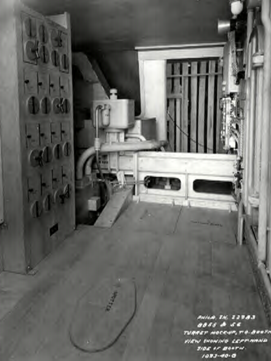
ANLN, TN, 12983 883 & 54 TURRET MOCKUP, T.O. BATH VIEW SHOWING LEFT HAND SIDE OF BATH. 1083-40-0