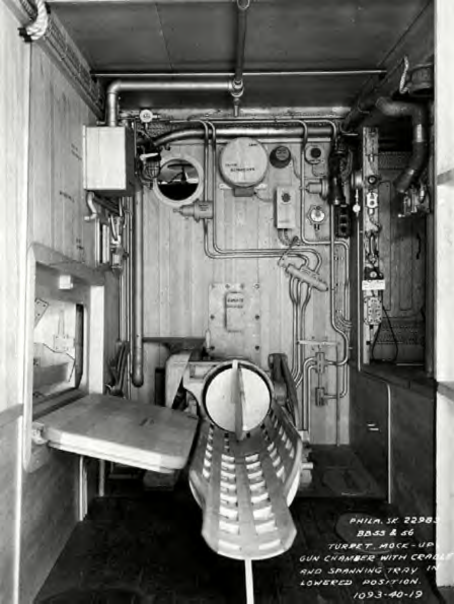
PHILA. SK 22983 BD55 & 56 TURRET, MOCK-UP GUN CHAMBER WITH CRAB AND SPANNING TRAY IN LOWERED POSITION. 1093-40-19