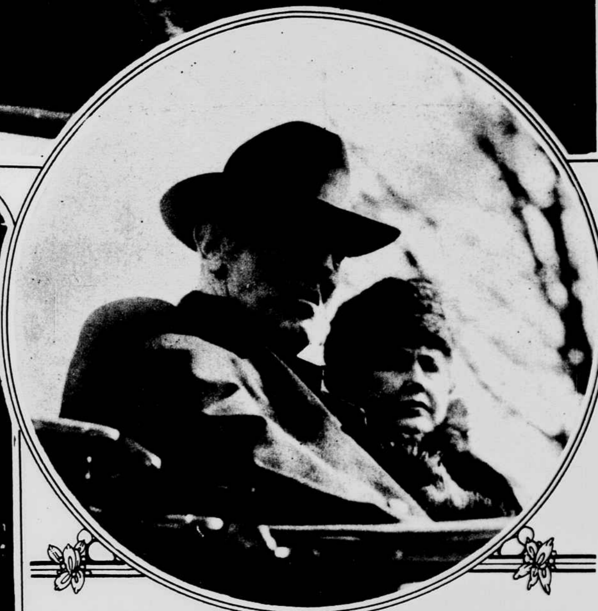
A close-up of the President and Mrs. Wilson, from photograph made last Sunday.