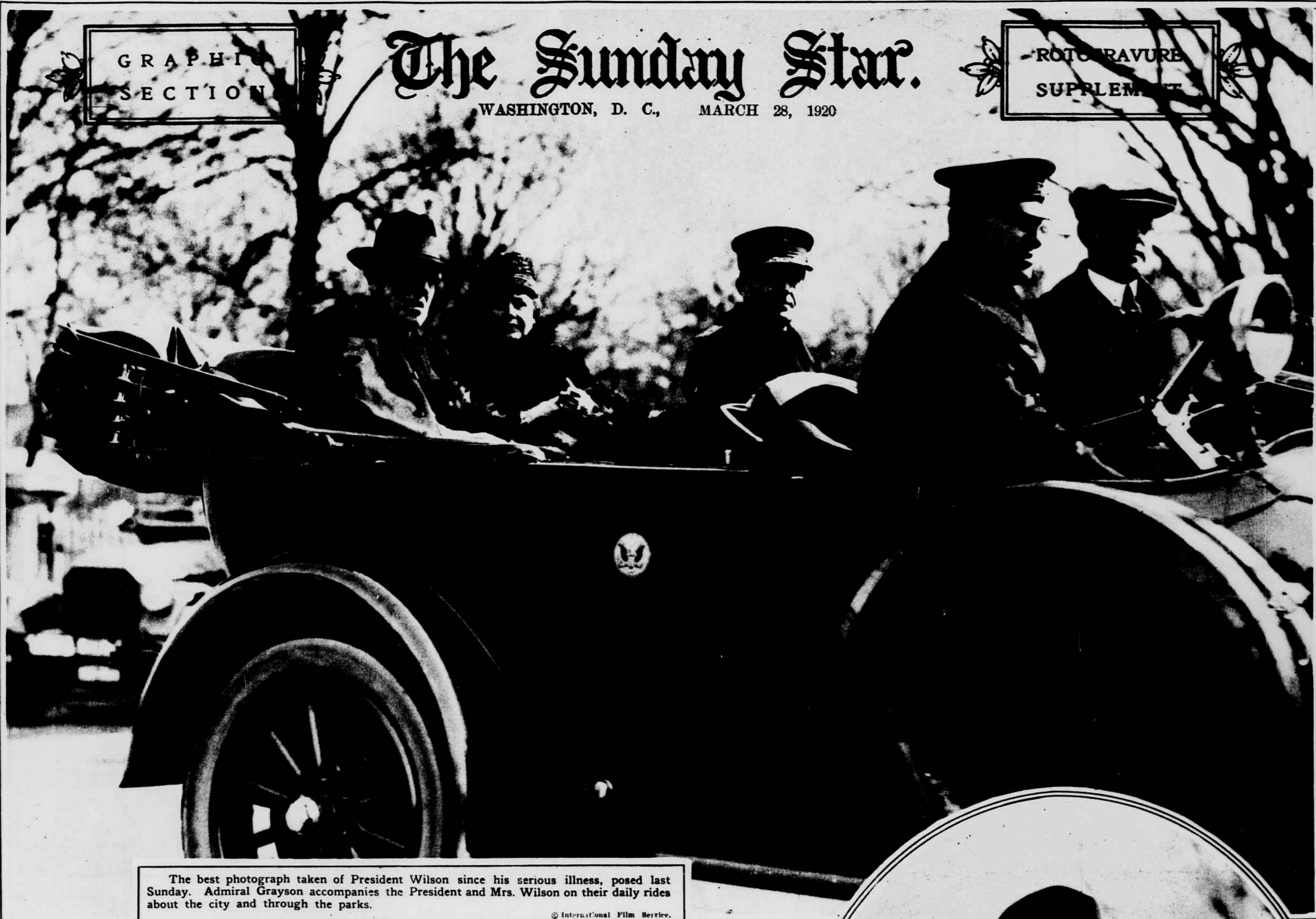
The best photograph taken of President Wilson since his serious illness, posed last Sunday. Admiral Grayson accompanies the President and Mrs. Wilson on their daily rides about the city and through the parks.