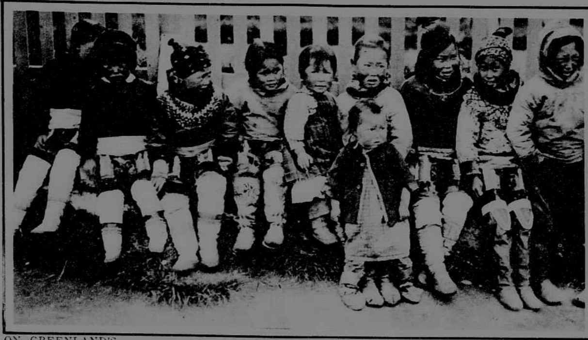
ON GREENLAND'S RECEPTION COMMITTEE. Ten picturesque Eskimo youngsters of Godthaab, quaintly garbed in their Sunday best, curiously await the arrival of the King and Queen of Denmark on the latter's first visit to Greenland.