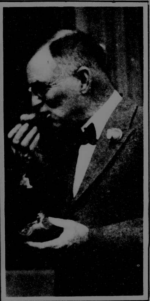
THE SECRETARY OF AGRICULTURE, Henry C. Wallace, falls for a couple of Indiana peaches—the kind that grow on trees weighing a pound and a quarter each—a gift from Senator Watson of the Hoosier State who recently received a shipment from a back home admirer.