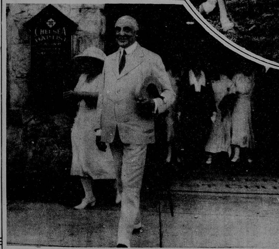
Right—LAST SUNDAY IN ATLANTIC CITY. President Harding smiles as, dressed in Washington white, he leaves church after attending morning services with Mrs. Harding and the other members of his weekend party at the shore.