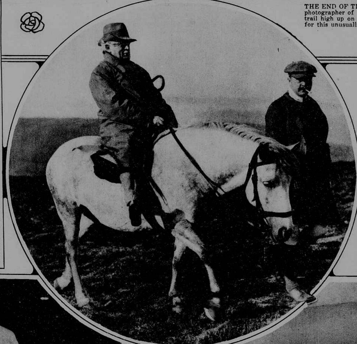
NOT NAPOLEON'S RETREAT FROM MOSCOW, but England's "man of the hour" Premier Lloyd George, being escorted, astride a highland pony, over the moors of bonny Scotland by the Duke of Atholl, his host at Blair Castle, where the little Welshman recently spent a few vacation days deer hunting.