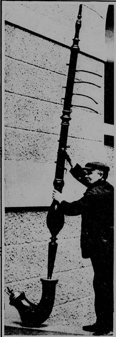
Above—This granddaddy of all pipes, presented to a German museum by the sole survivor of a club of sixteen members, was made so the entire club membership could smoke it at once. The bowl holds three pounds of tobacco. Whether the smoking of this young chimney was responsible for the killing off of the club's members is not reported.