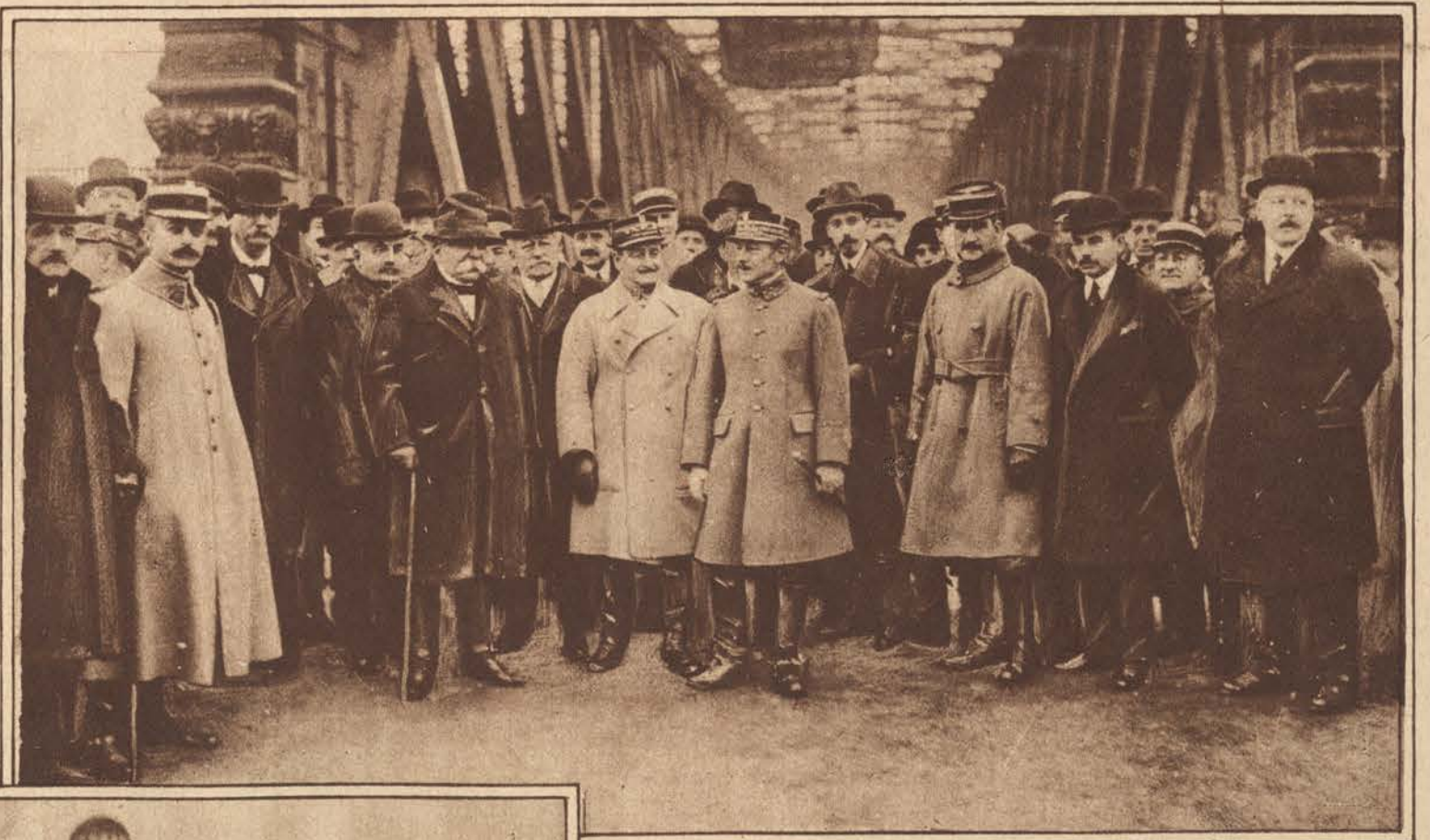
PREMIER GEORGES CLEMENCEAU, FOLLOWING HIS FAMOUS "ALL MUST WORK" ADDRESS AT STRASBOURG, VISITING THE KEHL BRIDGE OVER THE RHINE, ACCOMPANIED BY LEADING MEN OF ALSACE.