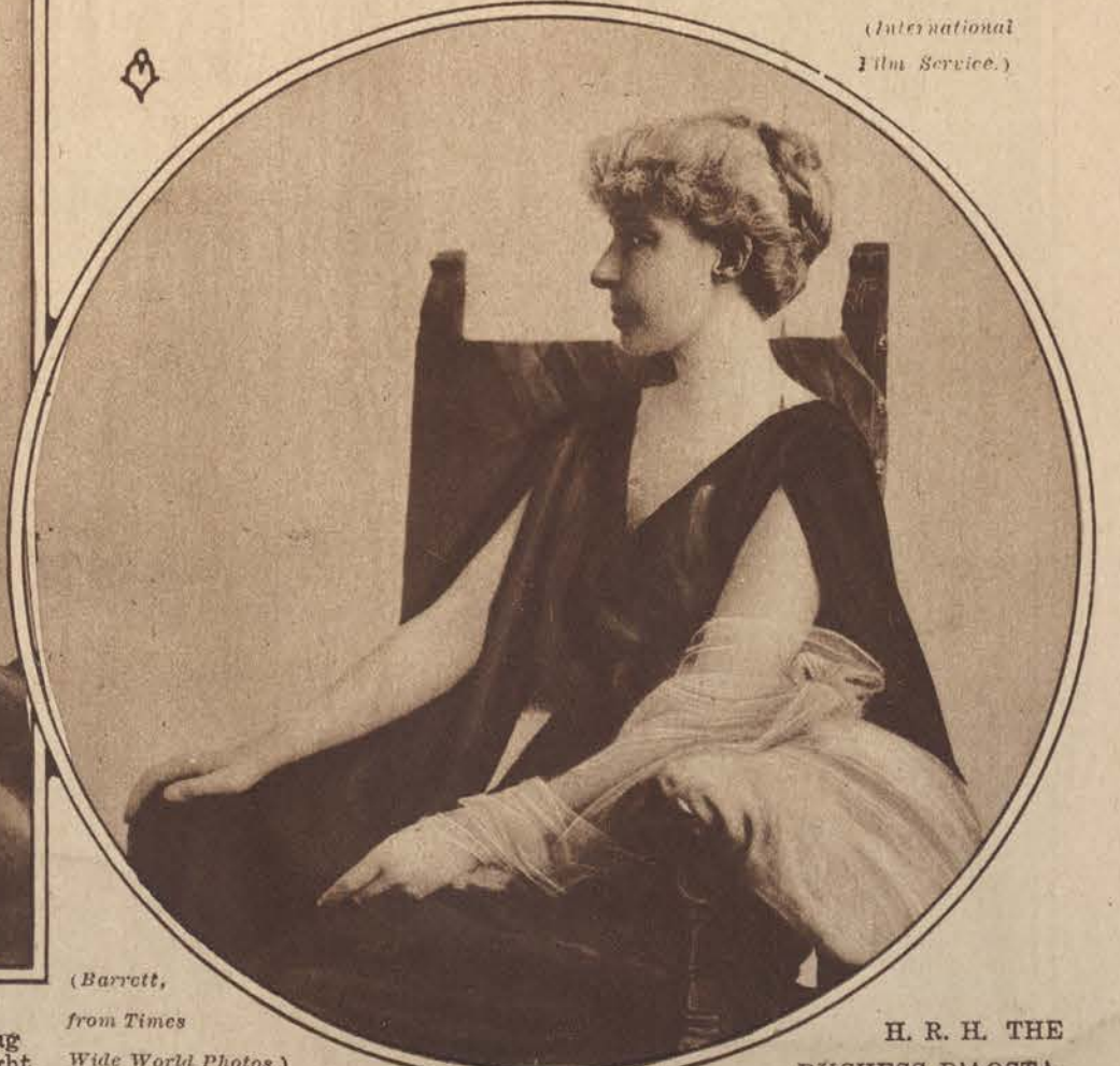
H. R. H. THE DUCHESS D'AOSTA,