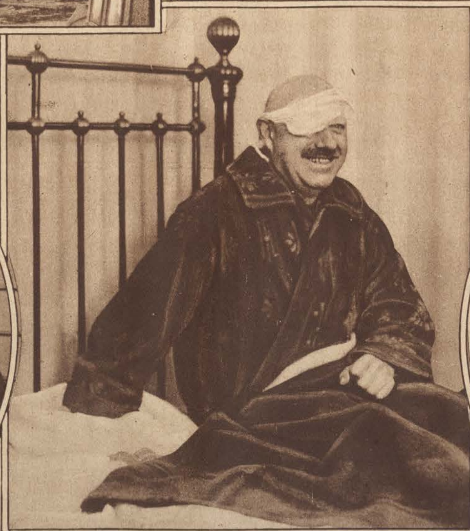
WILLIAM E. ("PUSSYFOOT") JOHNSON, American Dry Crusader in England, in a London Hospital After His Severe "Ragging" by London Students and Crowd, Which Resulted in the Removal of His Right Eye, His Gameness and Good Sportsmanship After the Incident Raising Him Over Night from a Position of Good-Natured Contempt to the Level of a Popular Hero.