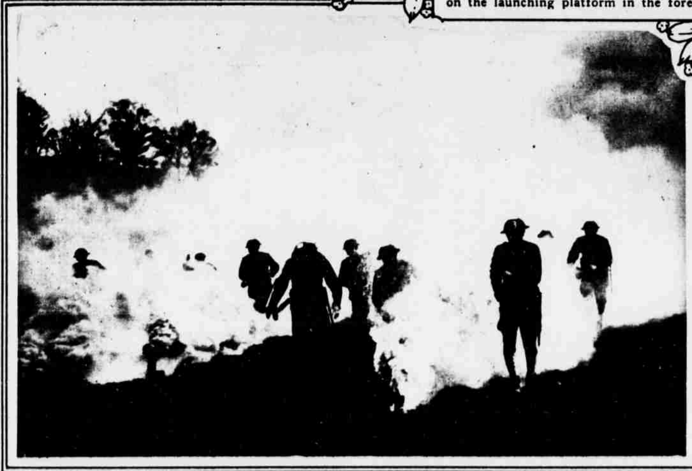
Modern warfare staged right in New York's back yard. A most remarkable exhibition in behalf of the Victory Loan was staged at Van Cortlandt Park by the Ordnance Department and the Chemical Warfare Service of the army. In this picture doughboys are advancing through a smoke screen.