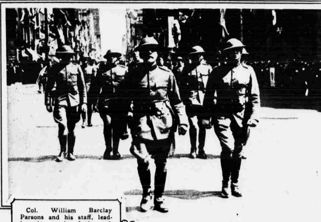
Col. William Barclay Parsons and his staff, leading the parade of the 11th Engineers on Fifth avenue.