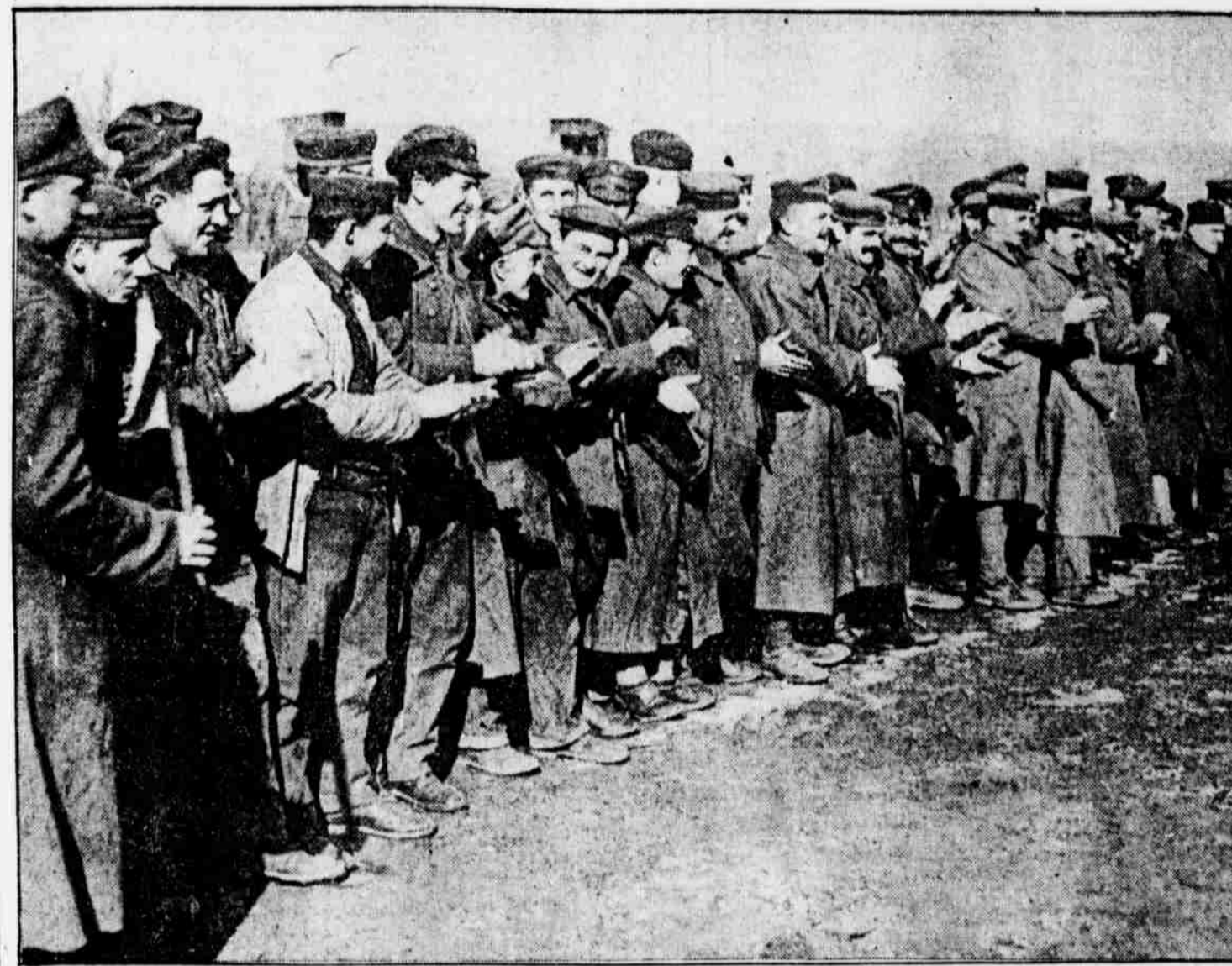
From Int. News...