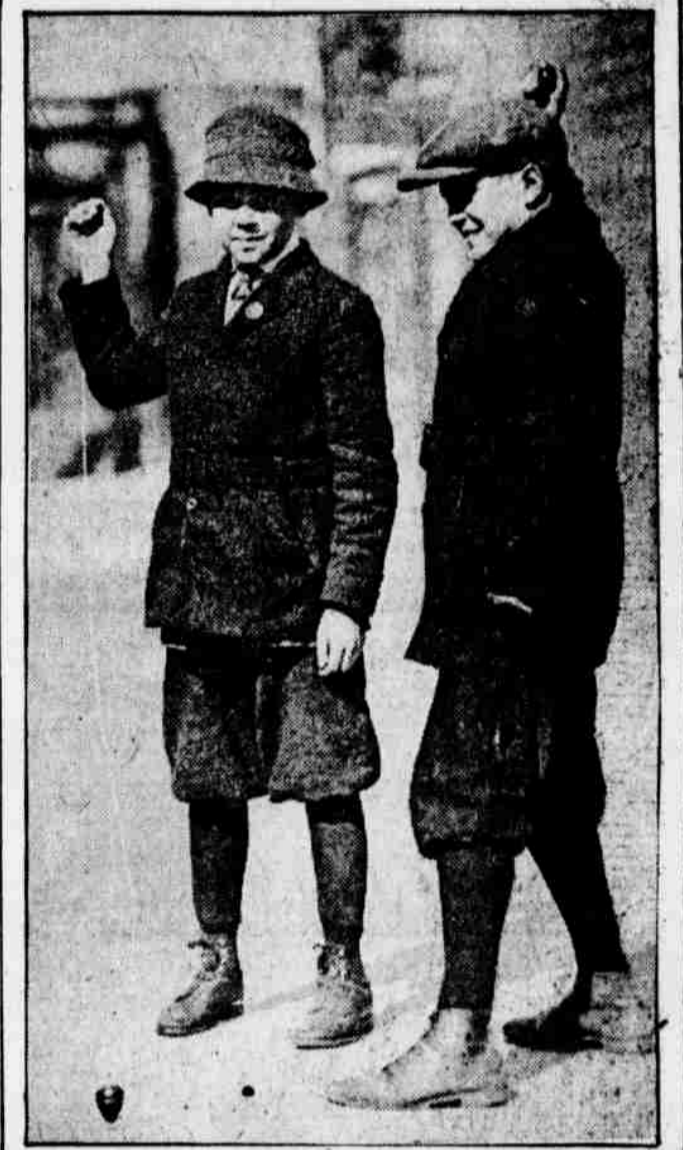
A SURE SIGN OF SPRING—The boy with the top makes his appearance on the city pavements.